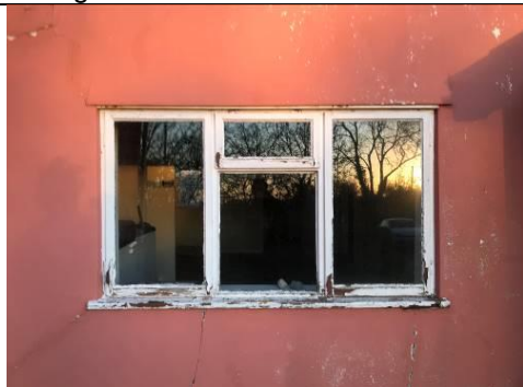
Sitting room west

Modern window midC20 with deterioration to cill and casements, replace with sympathetic detailed casement with slimlite glazing