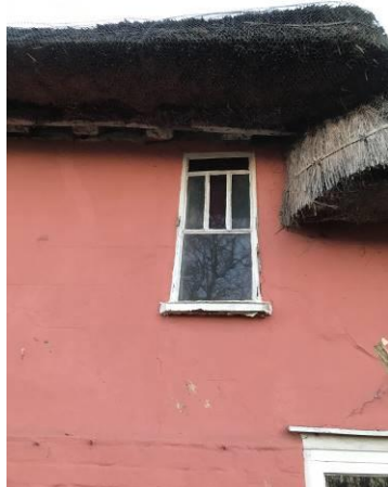
Upstairs lounge east

Coloured glass fixed window to stair, to be repaired and redecorated.