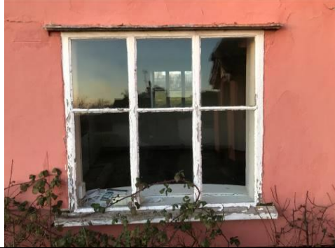
Dining room east

Overall in good condition, uniquely proportioned window. C19. Cill in poor condition. Replace cill, repair and redecorate.