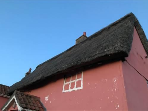
Bed 3 south