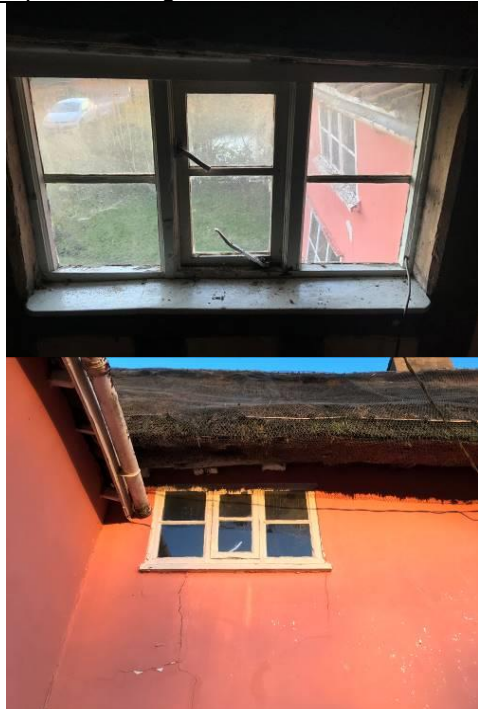
Upstairs lounge west

C19 3 light casement window. In Ok condition, to be repaired and redecorated.