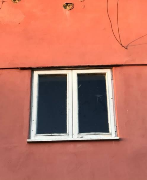
Bed 2 west

Modern window, midC20 replace with sympathetic detailed casement with slimlite glazing