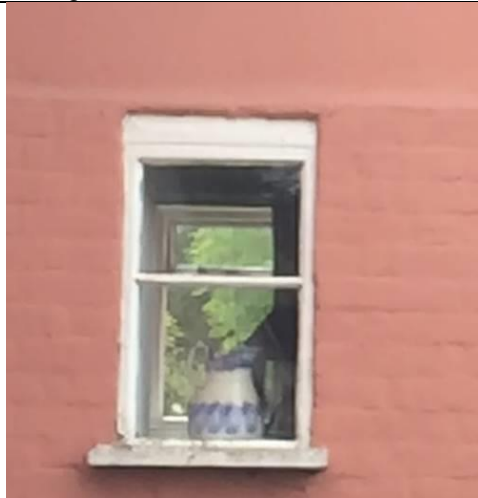
Dining room west

Modern window midC20 with deterioration to cill and casements, replace with sympathetic detailed casement with slimlite glazing