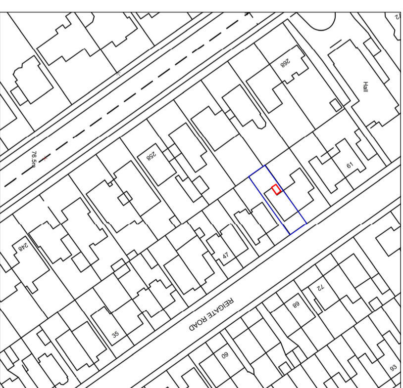
Site Plan 1:1250