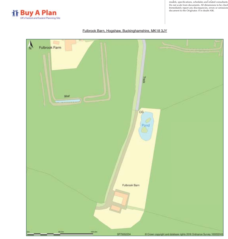
Location Plan 1:500

Site Plan shows area bounded by: 474655.86, 221185.87, 473205.86, 220486.87 (at a scale of 1:1250); OSGridRef: SP75052324. The representation of a road, track or path is no evidence of a right of way. The representation of features as lines is no evidence of a property boundary. Produced on 21st Oct 2018 from the Ordnance Survey National Geographic Database and incorporating surveyed 'current' mission available at this date. Reproduction in whole or part is prohibited without the prior permission of Ordnance Survey. © Crown copyright 2018. Supplied by www.buyaplan.co.uk as licensed Ordnance Survey content (10002514). Unique plan reference: #0205050-201802. Ordnance Survey and the OS Symbol are registered trademarks of Ordnance Survey, the national mapping agency of Great Britain. Buy A Plan logo, pdf design and the www.buyaplan.co.uk website are Copyright © Plan Inc Ltd 2018.