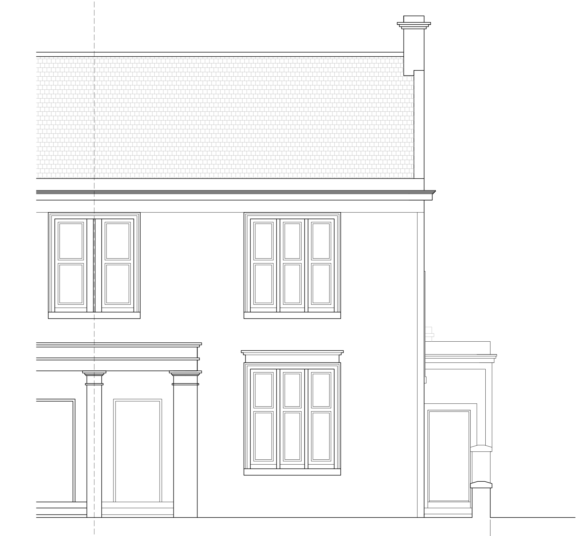
FRONT ELEVATION - AS EXISTING