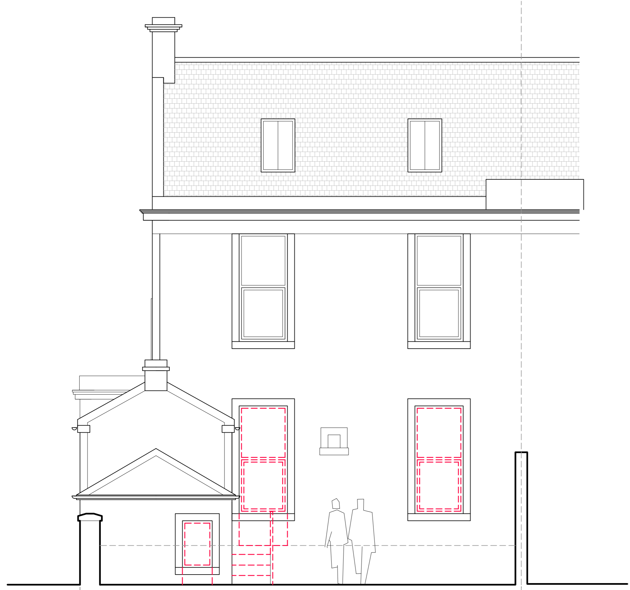
REAR ELEVATION - AS EXISTING