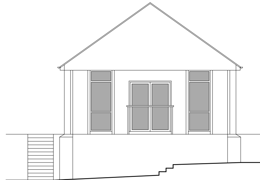
Proposed South Elevation @ 1:100