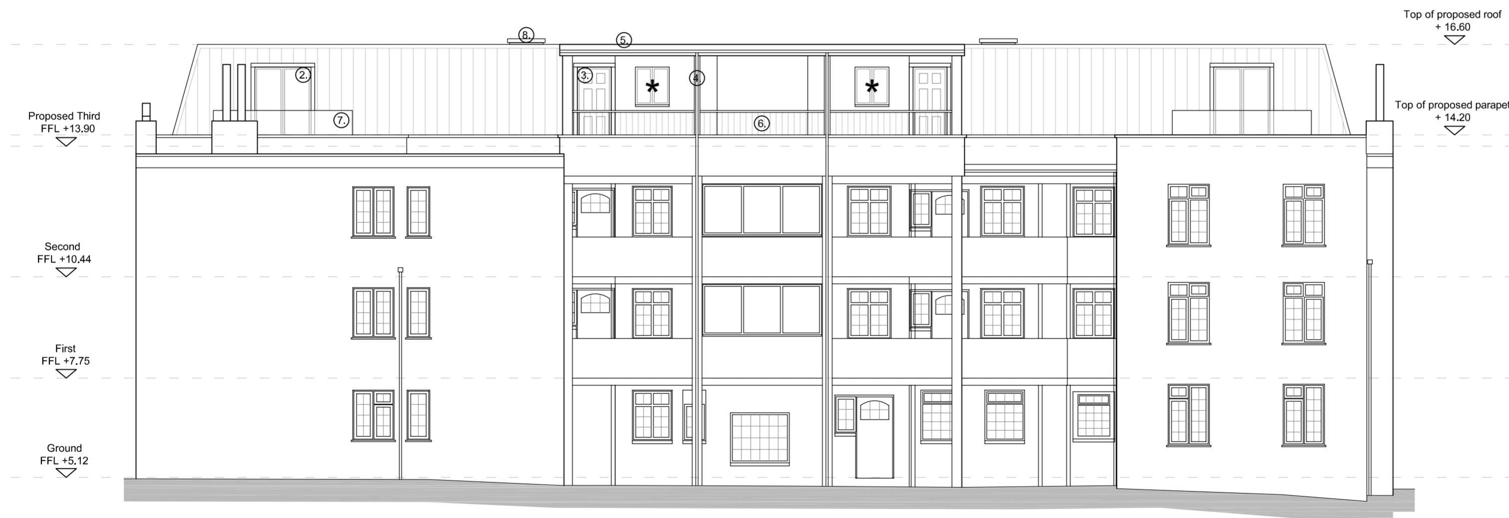
Proposed North Elevation