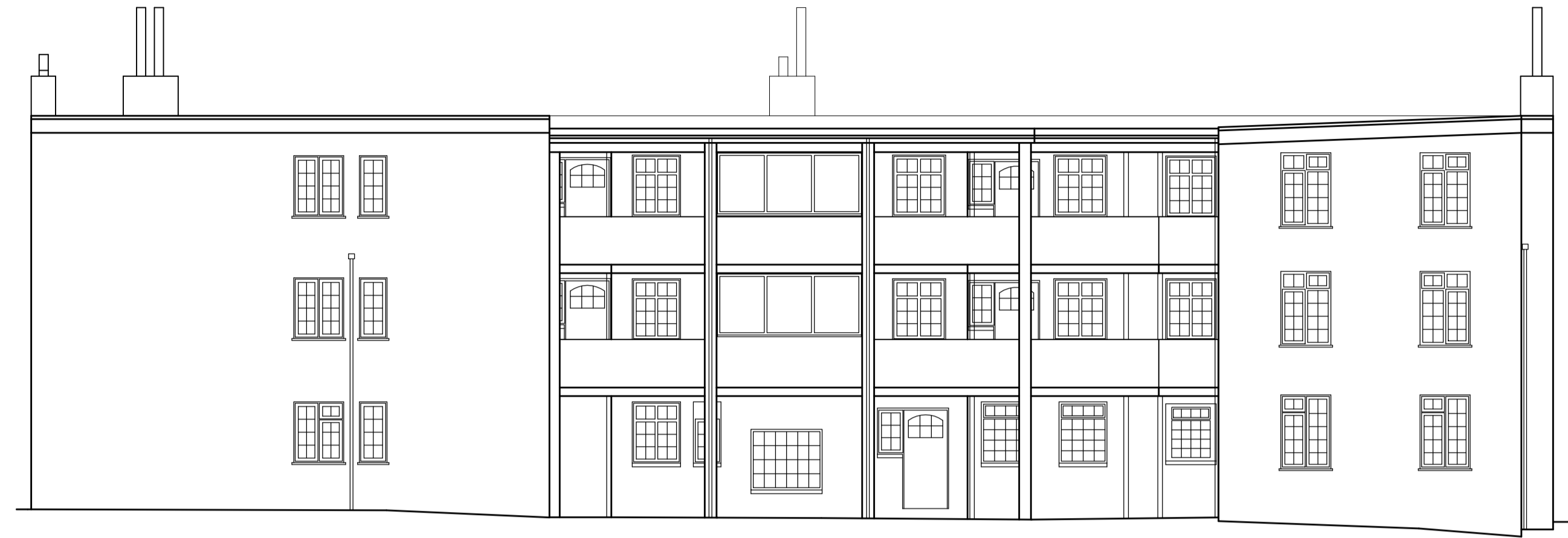
0.00m DATUM NORTH ELEVATION