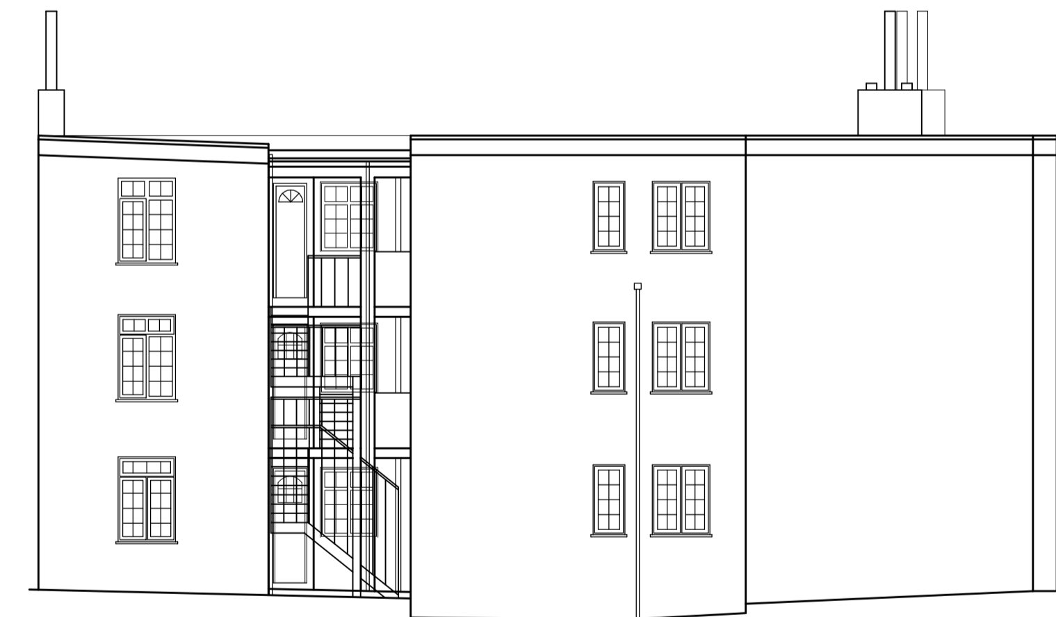
0.00m DATUM WEST ELEVATION

NOTES: LEVELS RELATE TO O.S. DATUM ALL DIMENSIONS & LEVELS SHOWN IN METRES ON SITE DIMENSION ACCURACY IS TAKEN RELATIVE TO THE PRINTED SCALE AND SHOULD BE CHECKED ON SITE WHERE OF CRITICAL IMPORTANCE