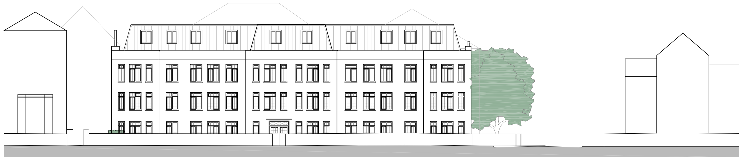
Proposed Context & Street Scene Elevation