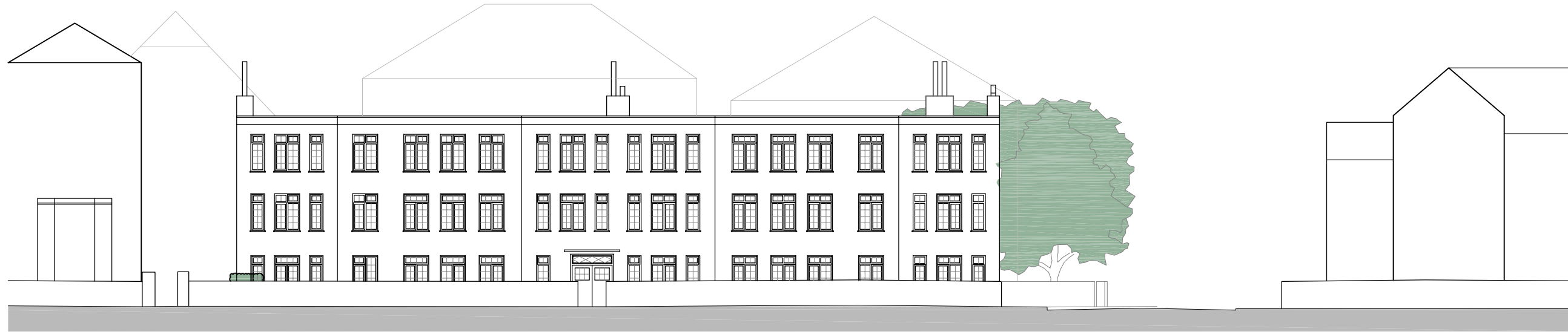
Existing Context & Street Scene Elevation