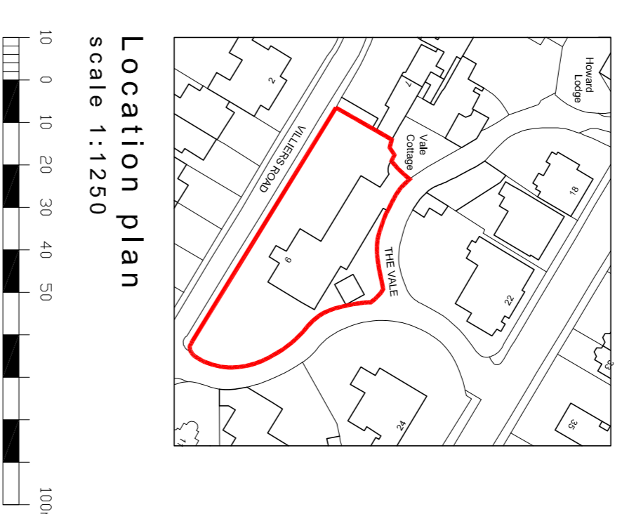
Location plan scale 1:1250

Ordnance Survey, (c) Crown Copyright 2021. All rights reserved. Licence number 10002432