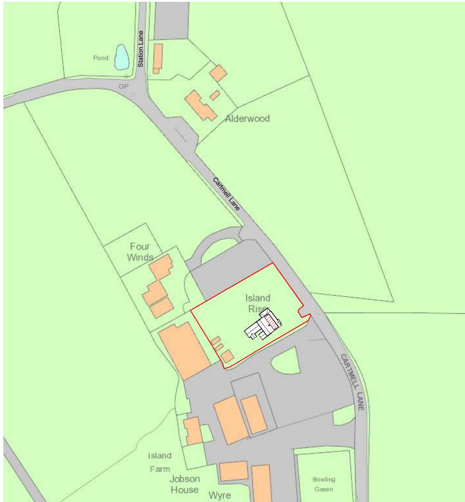
1 Location Plan 1 : 1250