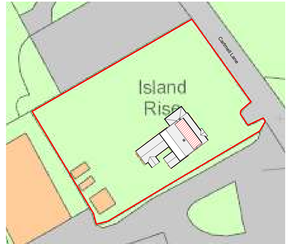
2 Site Plan 1 : 500

NOTE: Dimensions are not to be scaled from this drawing. All measurements to be checked on site prior to work commencing. Any discrepancy to be reported to Plan and Design immediately.