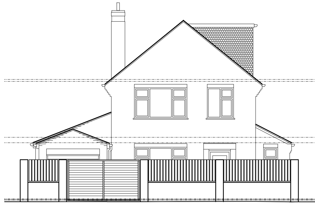
FRONT ELEVATION – BOUNDARY TREATMENT