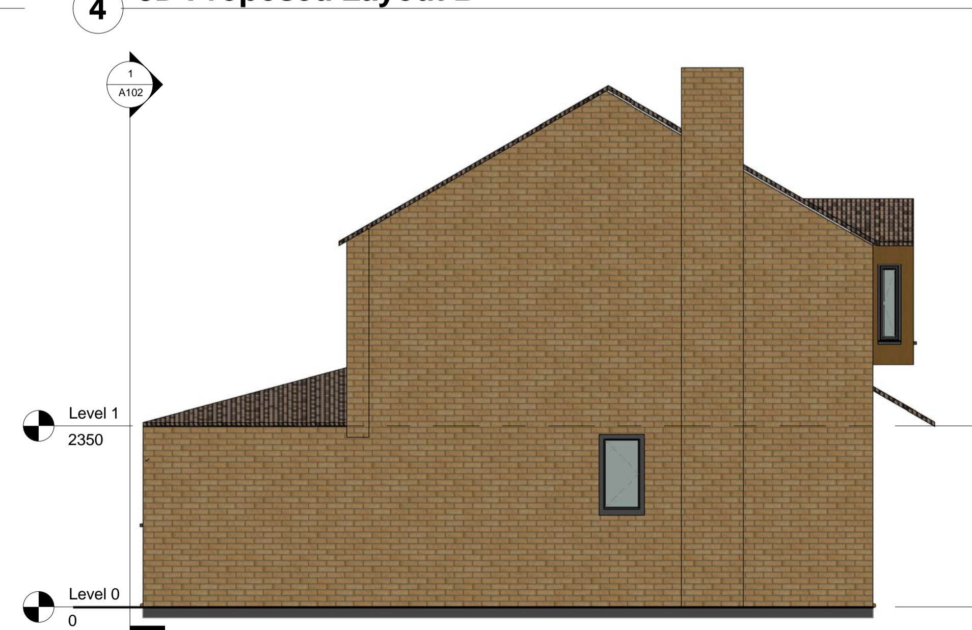
2 Proposed Extension Elevation B 1 : 50