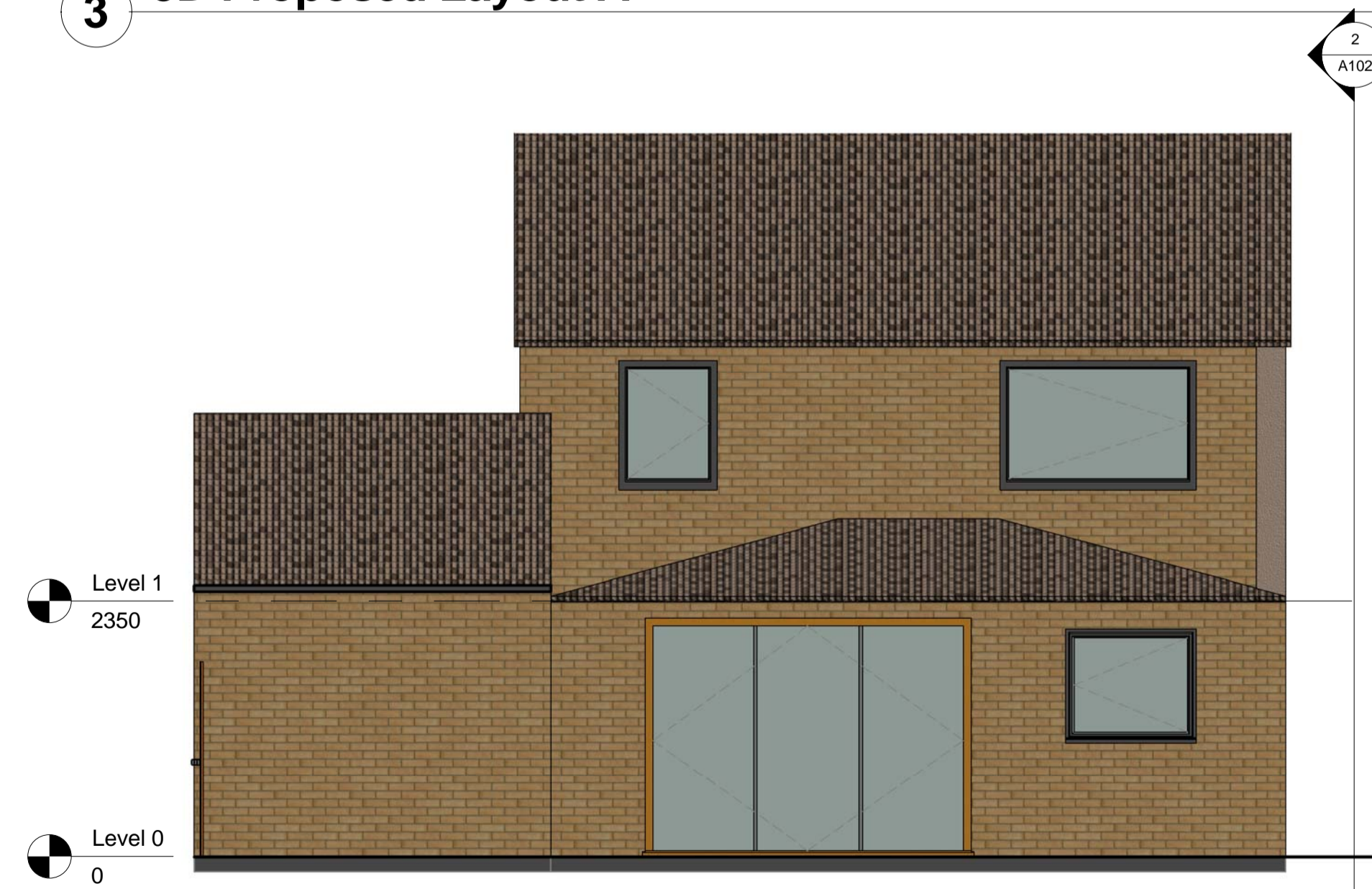
1 Proposed Extension Elevation A 1 : 50