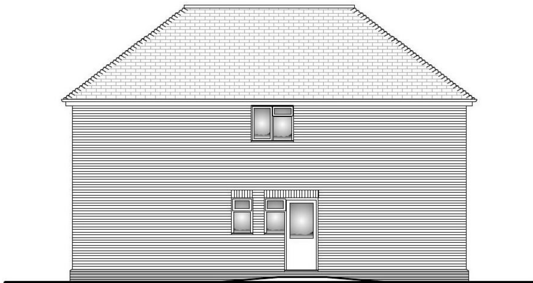
Proposed South Eastern Side Elevation