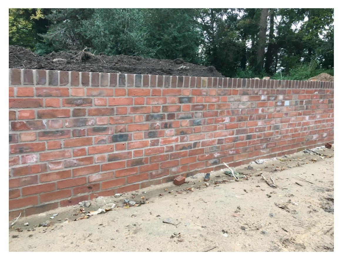
Watergate Blend brick used to boundary wall on Raby Estate