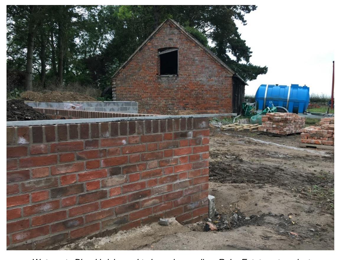
Watergate Blend brick used to boundary wall on Raby Estate set against existing farm outbuilding