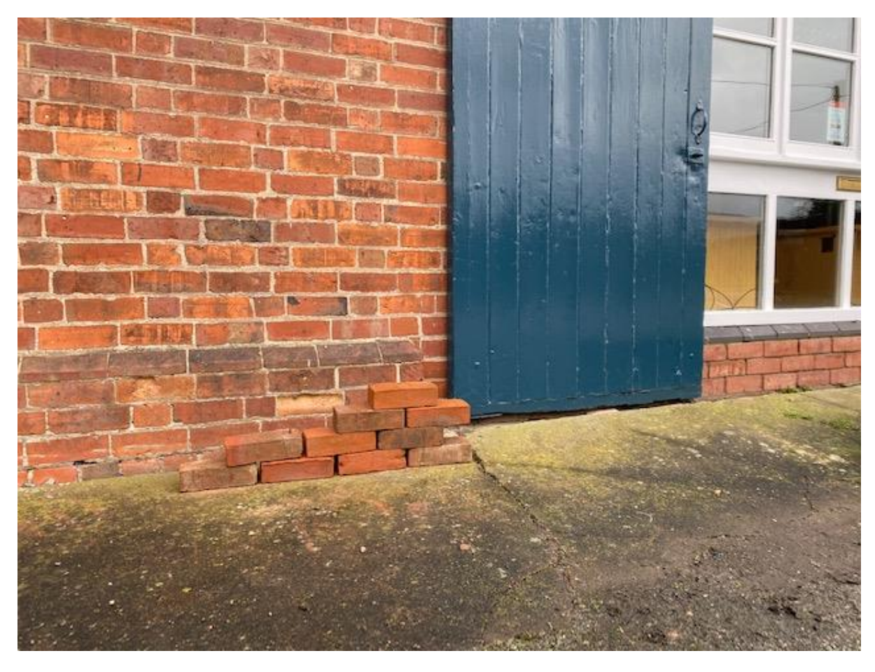
Watergate Blend brick sample shown against brickwork to Raby Estate Office