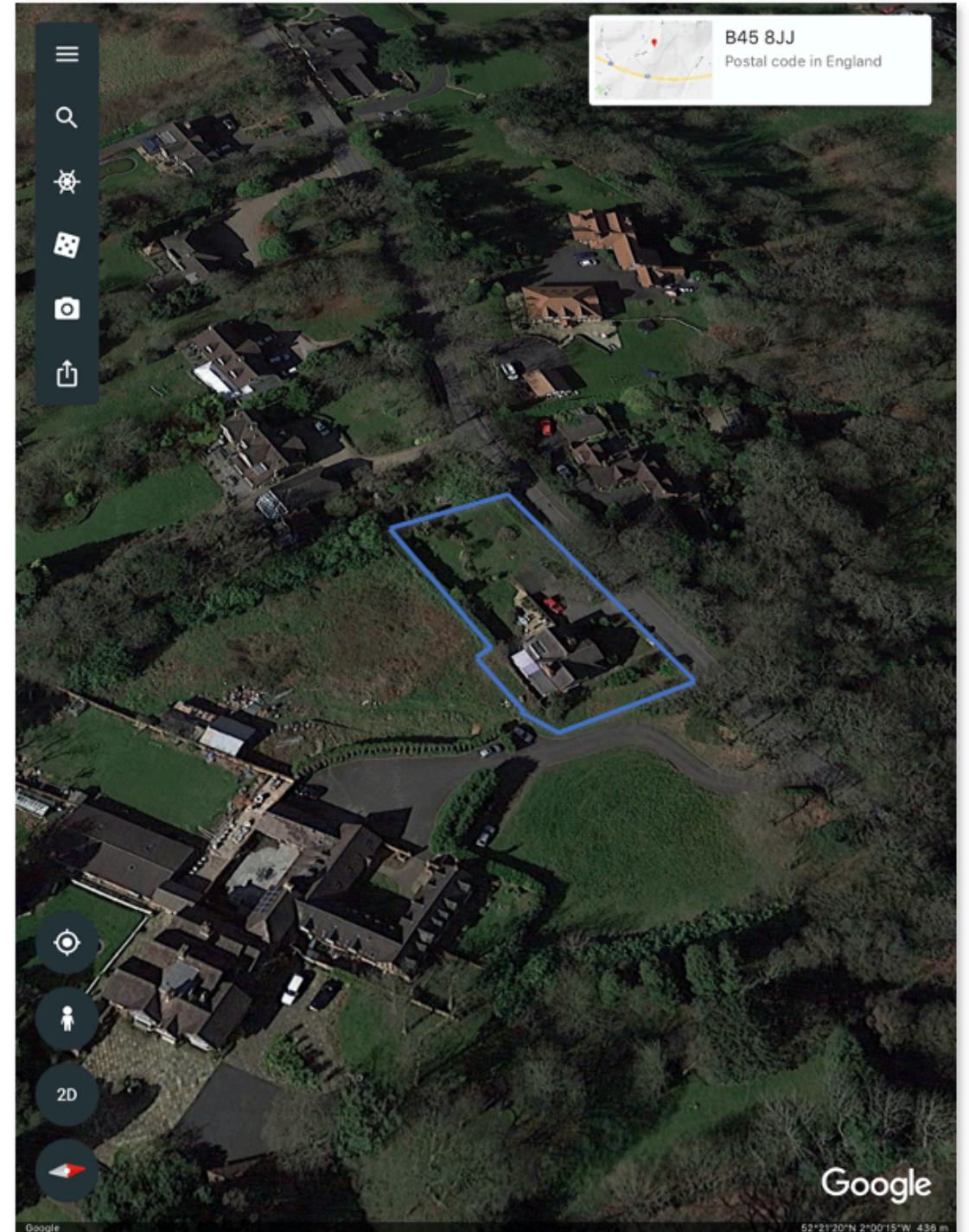
Google Earth Photograph Blue - Boundary