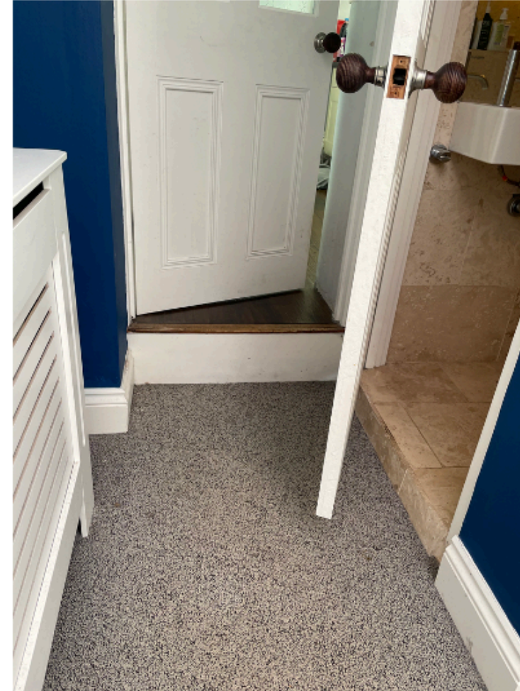
STEP FROM CONSERVATORY TO UTILITY ROOM STEP FROM CONSERVATORY TO WC