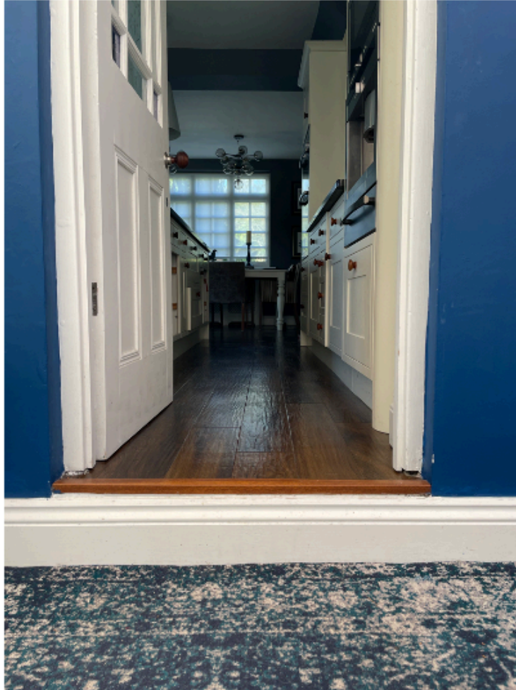
STEP FROM CONSERVATORY TO KITCHEN