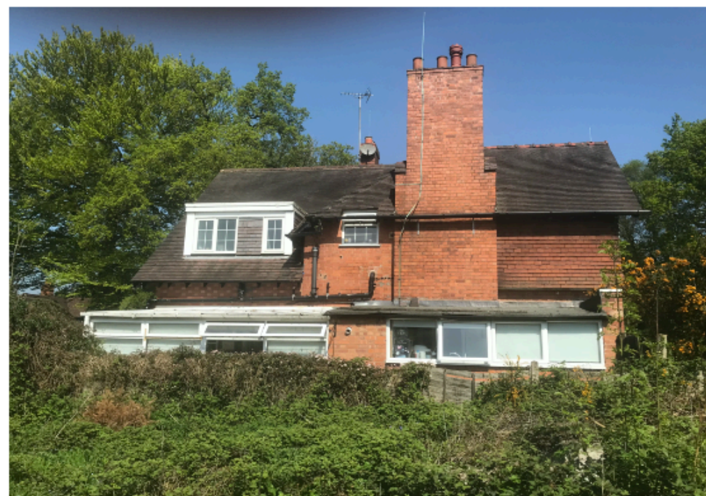
FROM SIDE FIELD