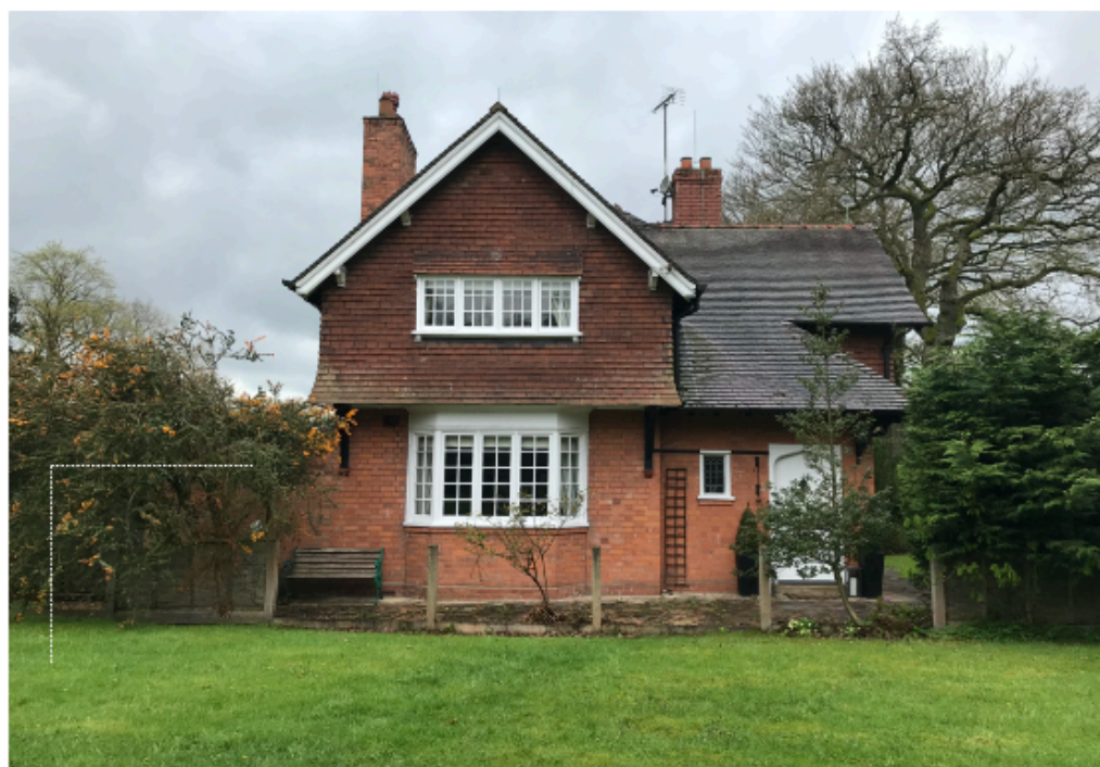
PRINCIPAL ELEVATION (from original driveway)