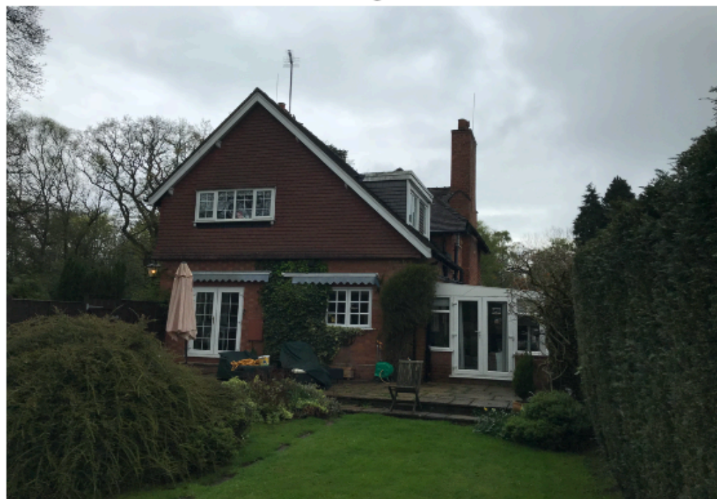
FROM REAR GARDEN