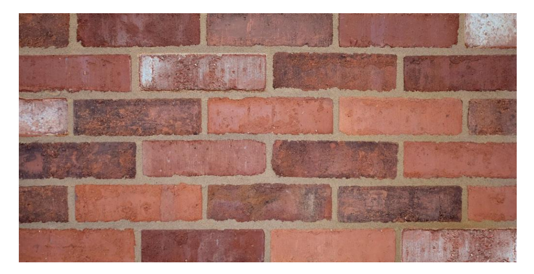
Above; 'Tatton' blend