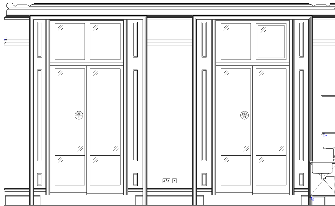
500_003 03 Elevation C 1:20