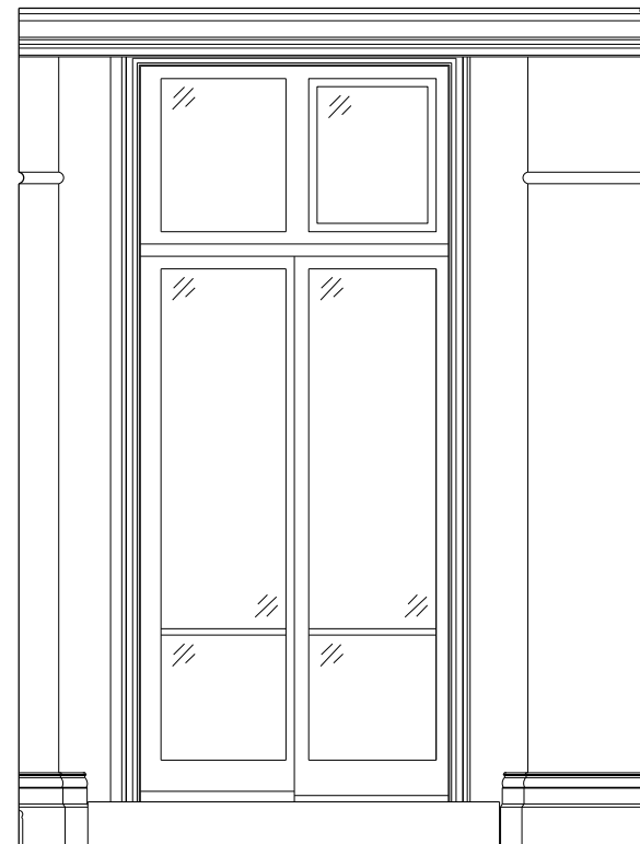
100_107 03 Elevation D 1:20