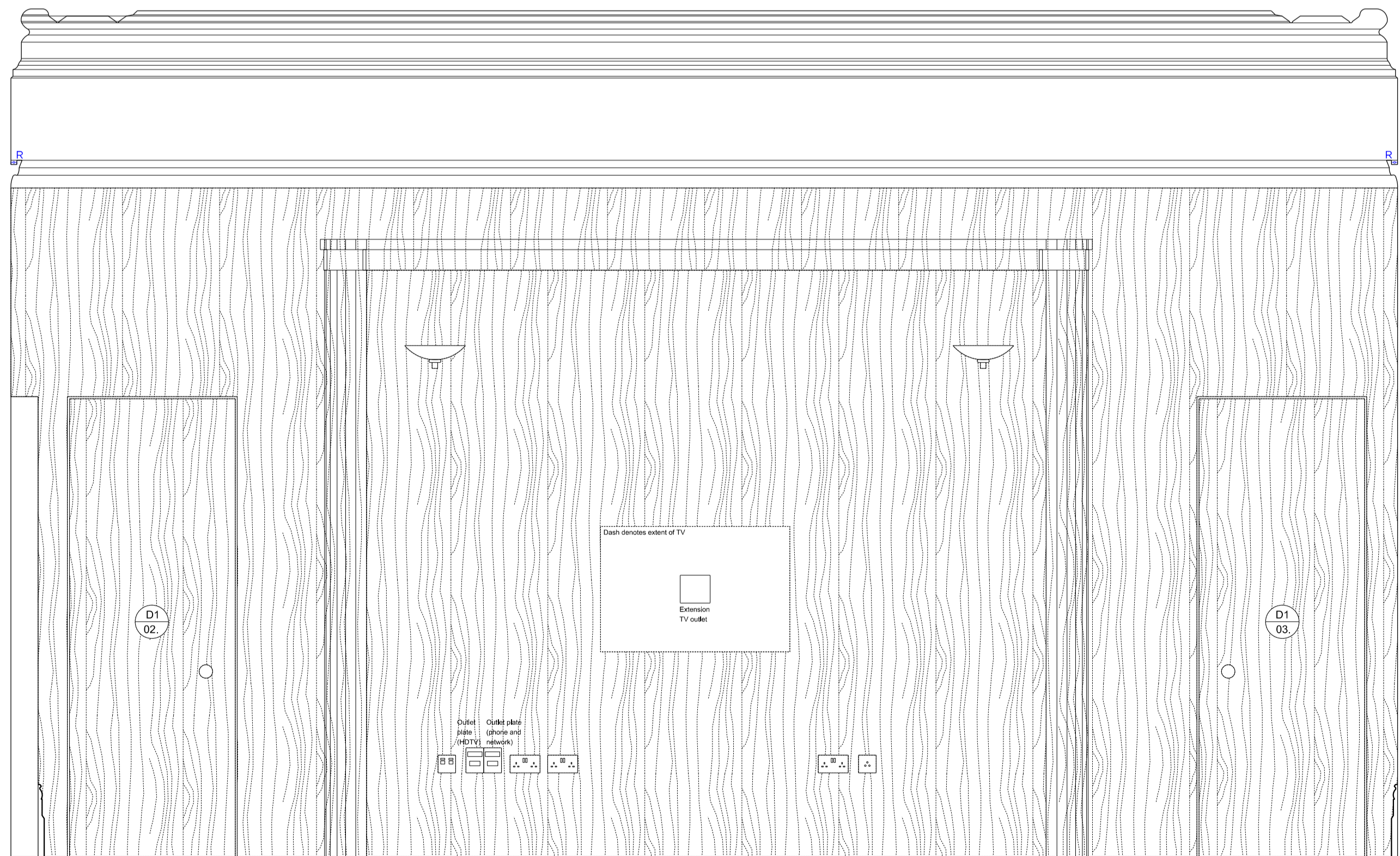
500_002 02 Elevation A 1:20