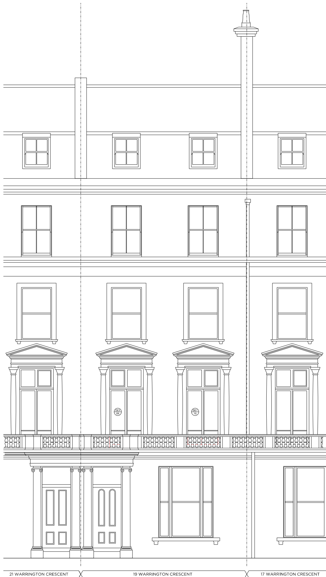
000_003 01 Front Elevation 1:50