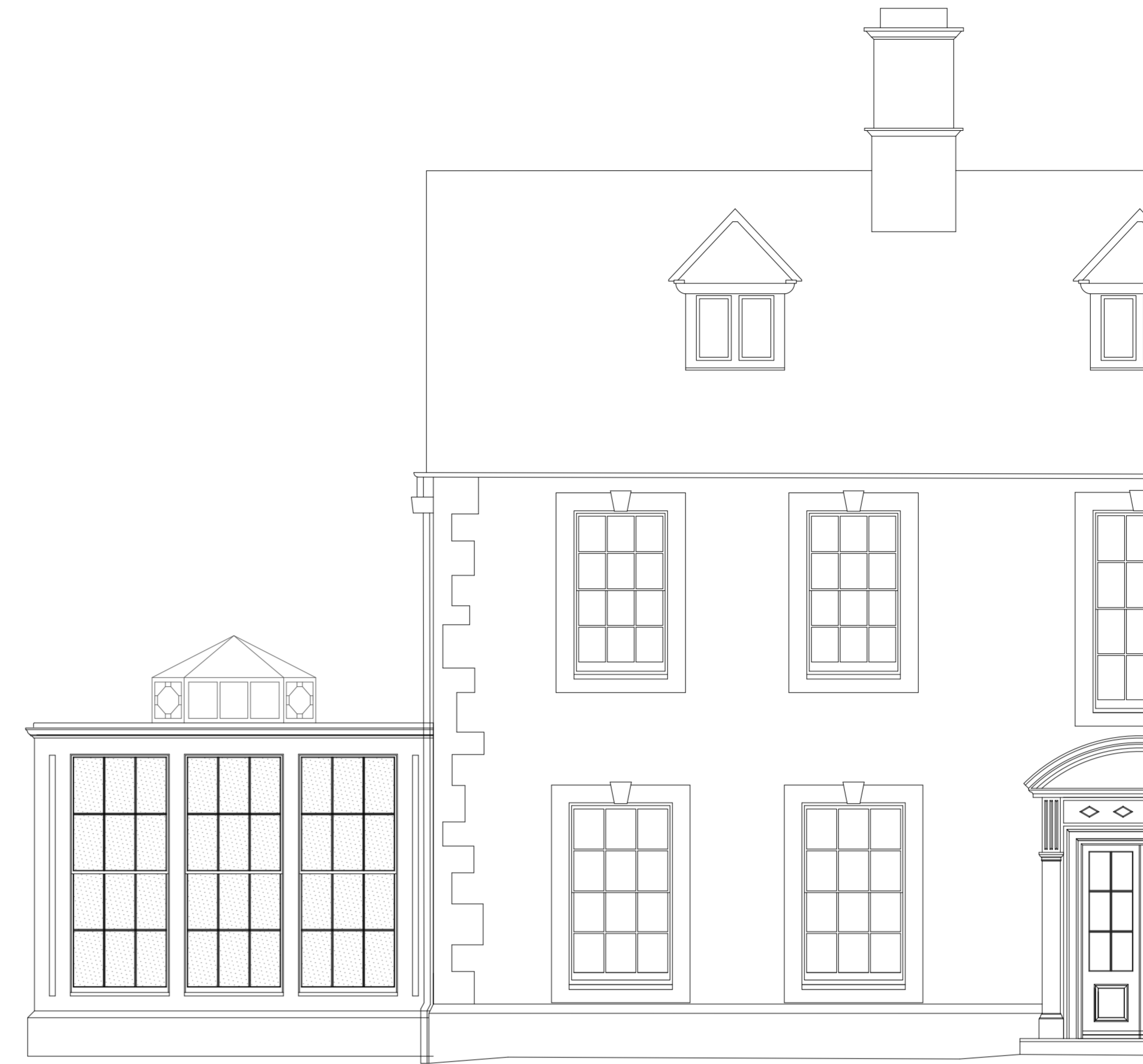
EAST ELEVATION SCALE: 1:50