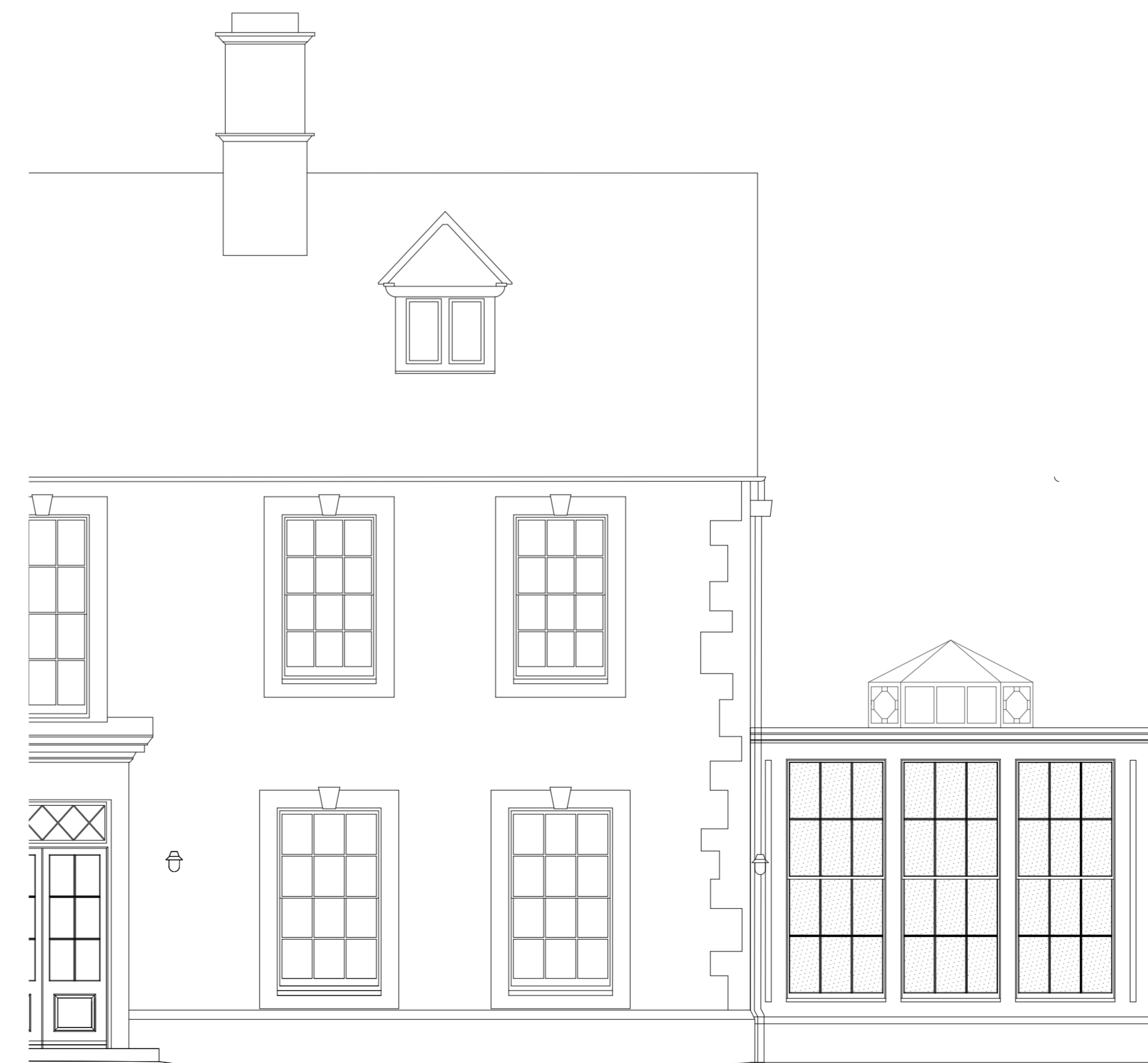
WEST ELEVATION SCALE: 1:50