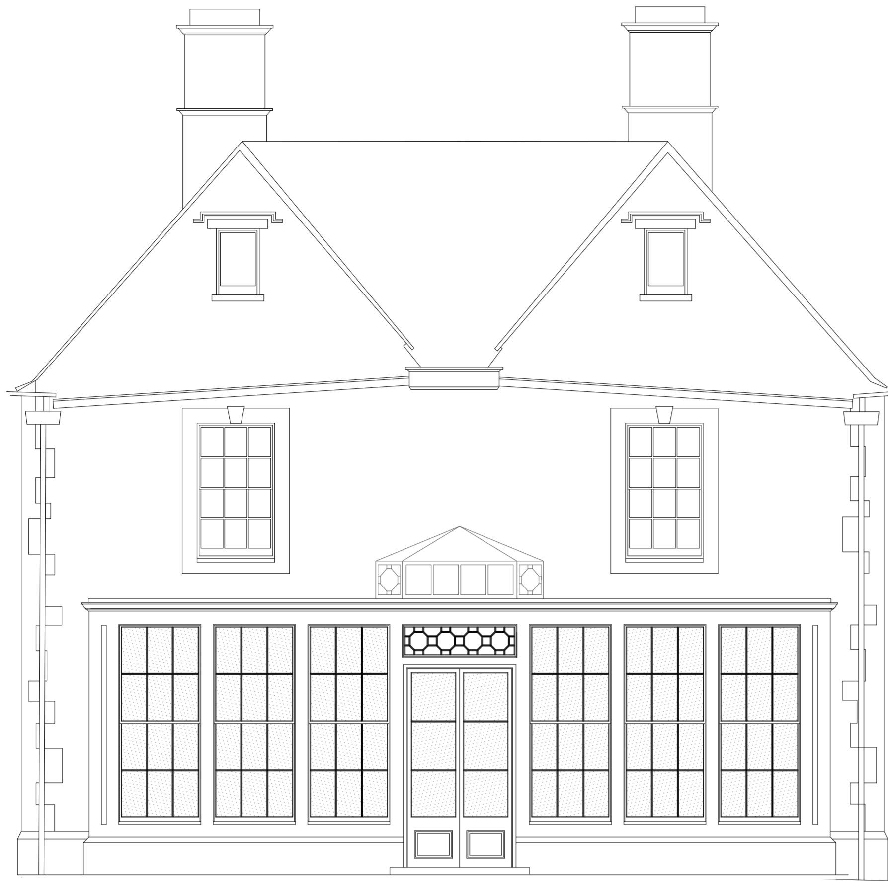
SOUTH ELEVATION SCALE: 1:50