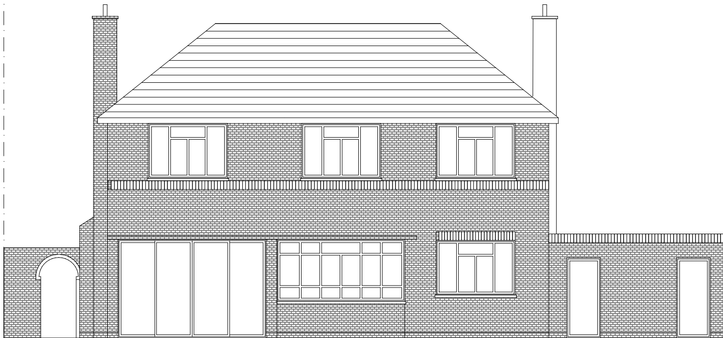
EXISTING REAR ELEVATION 1:150