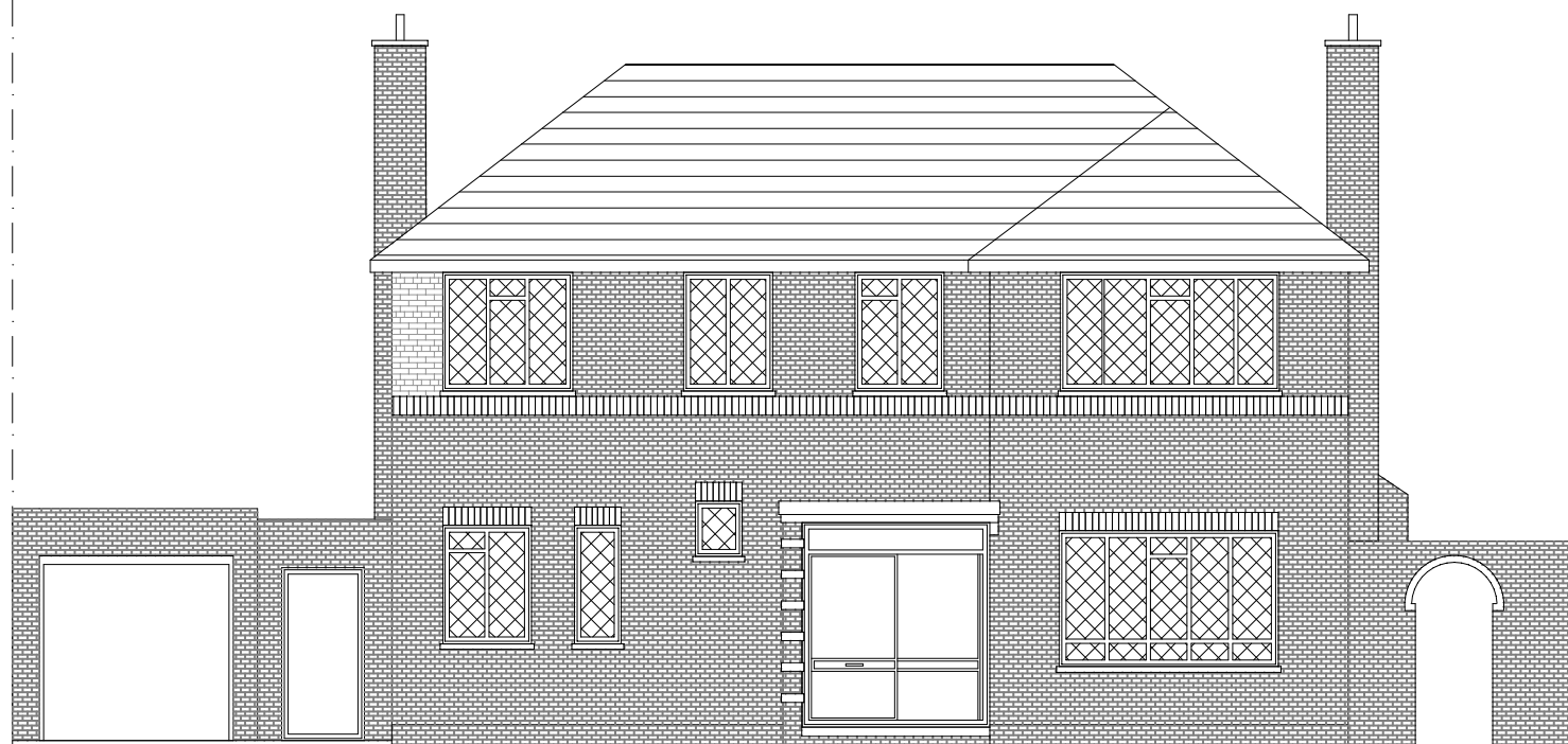
EXISTING FRONT ELEVATION 1:150