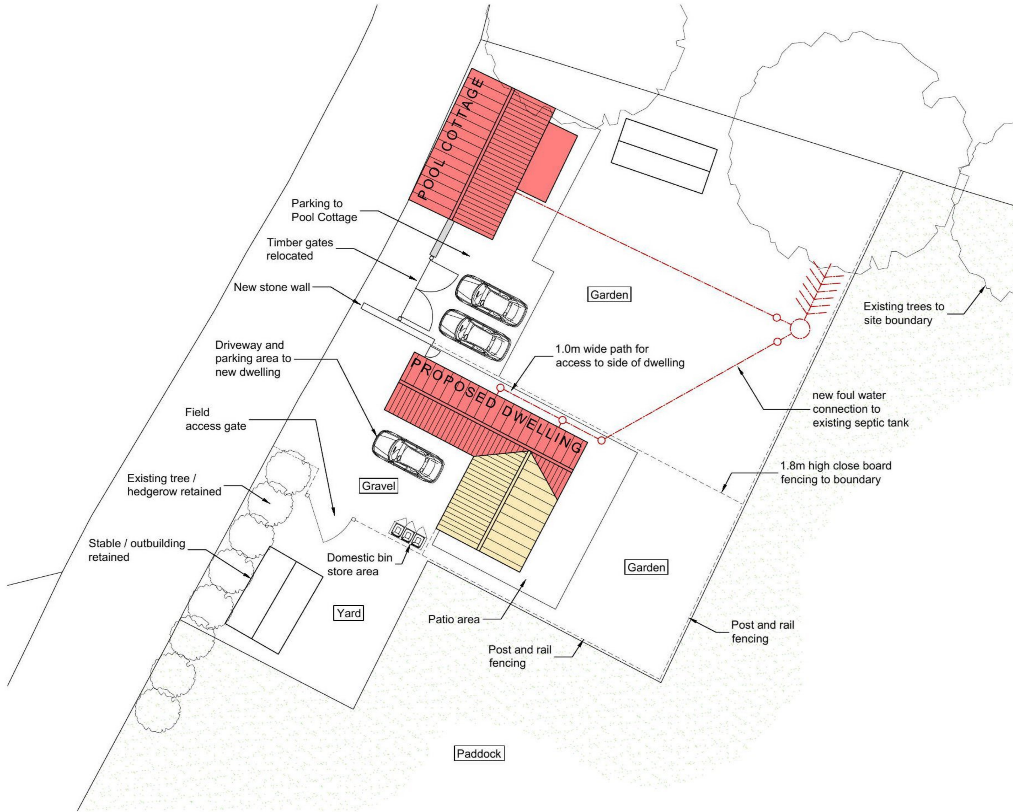
Proposed Block Plan Scale 1:200