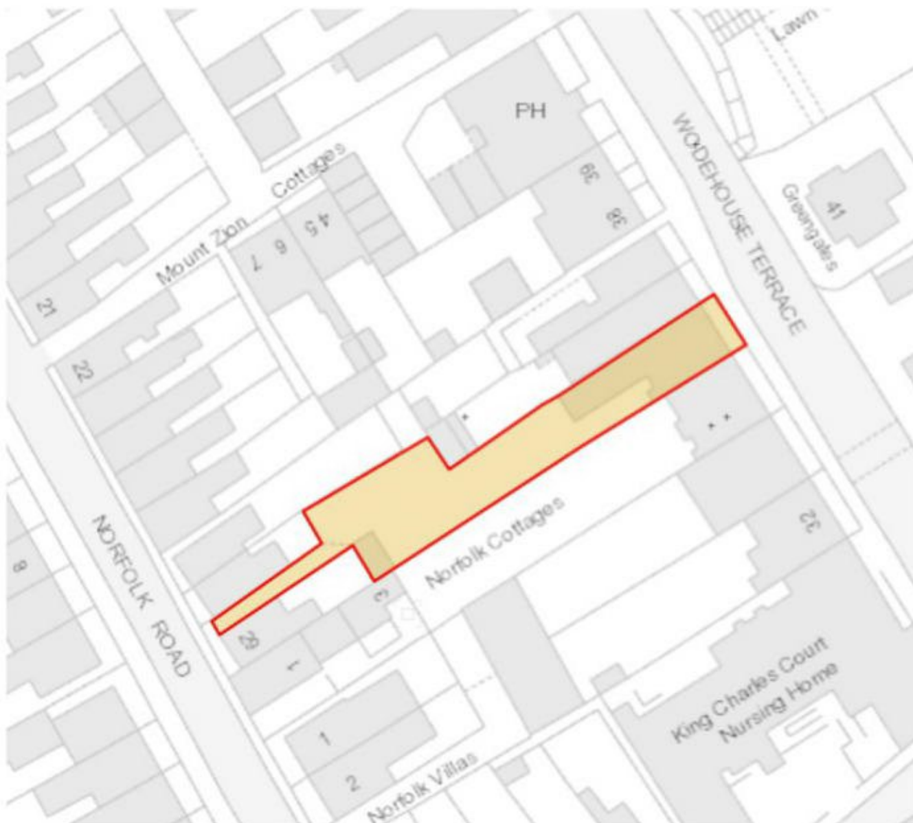
Site location plan with boundary line indicated in red

The property is a 4 bedroom mid-terraced Victorian house. The front of the property has a painted pebbledash finish but is generally in keeping with the majority of buildings on the terrace. The rear of the property has been extended in the 1980's. The extension is of poor quality and suffering from rising damp. The property has a large back garden and has rear access, via a narrow path, to Norfolk road.