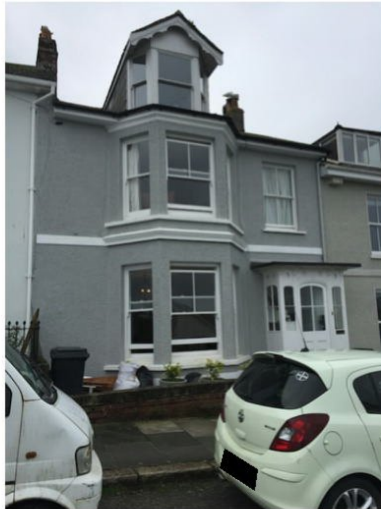
Front Elevation of 35 Wodehouse Terrace.