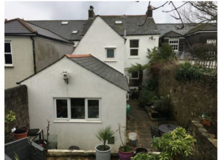
Rear views and garden