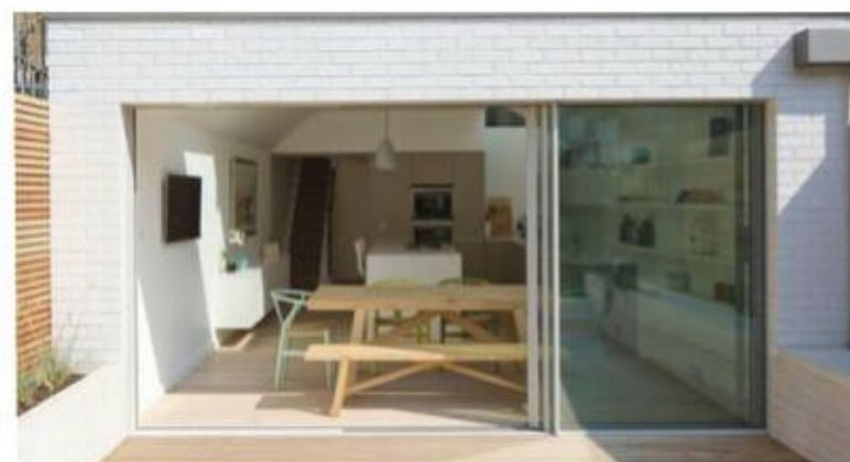
Example of suggested materials.