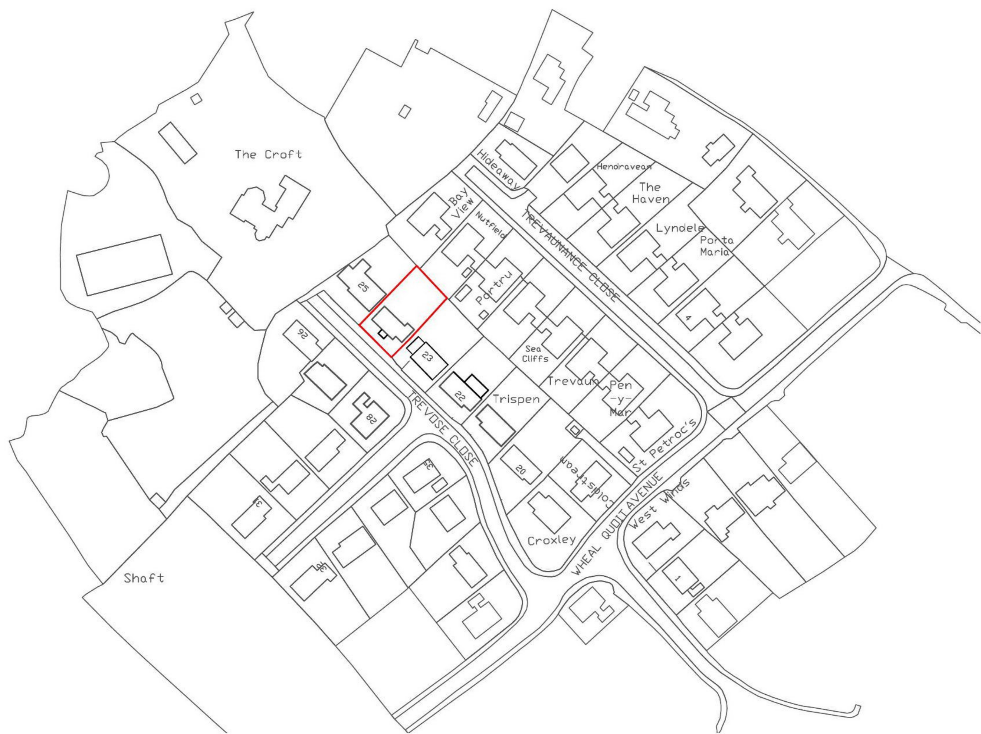
Site Location Map 1:1250