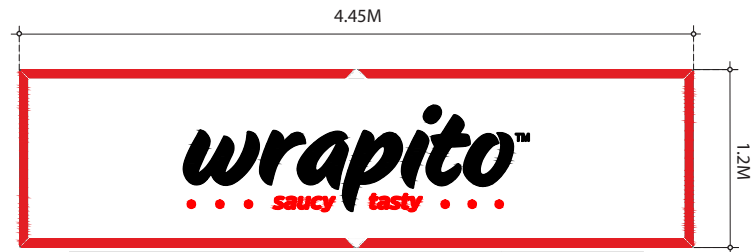
EXISTING FASCIA SIGNAGE 1: 50