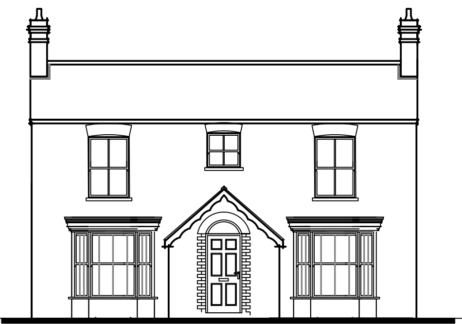
EXISTING FRONT ELEVATION 1:100 - SOUTH WESTERN