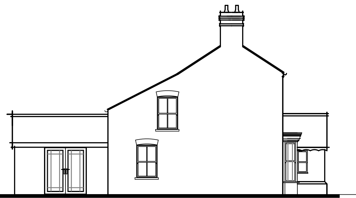
EXISTING SIDE ELEVATION 1:100 NORTH WESTERN