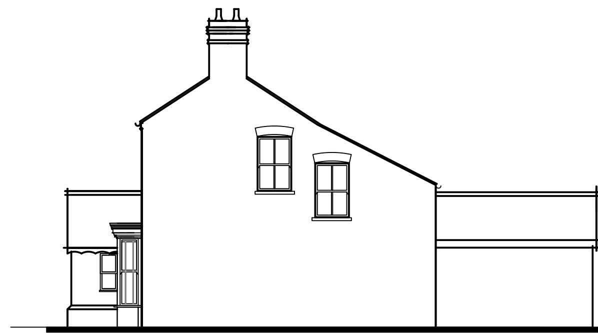
EXISTING SIDE ELEVATION 1:100 SOUTH EASTERN