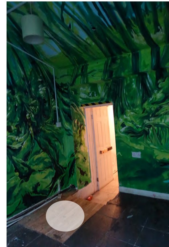
2. door to the house and steps viewed from the workshop