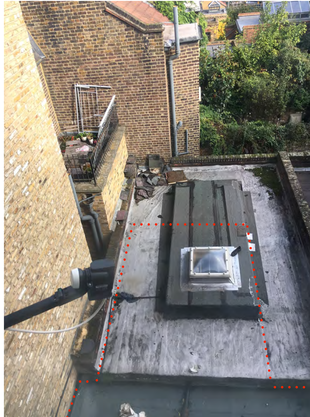
1. workshop roof viewed from the first floor of the house

The author has not had access to the property due to Covid restrictions.