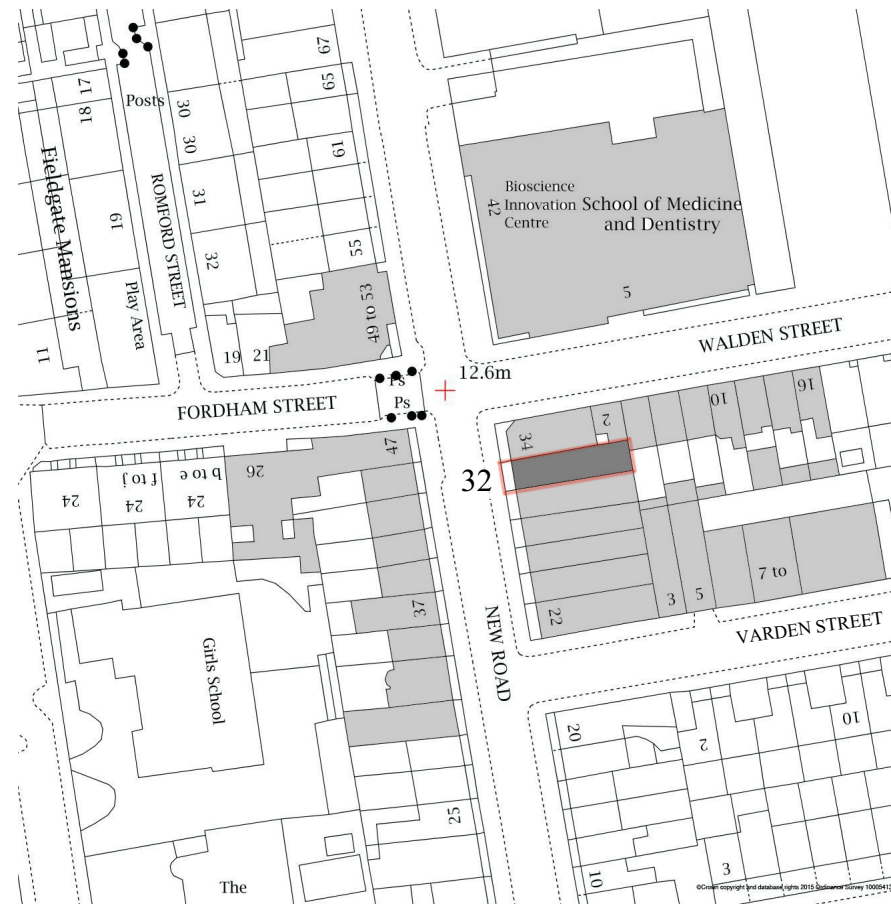
Location plan 32 New Road