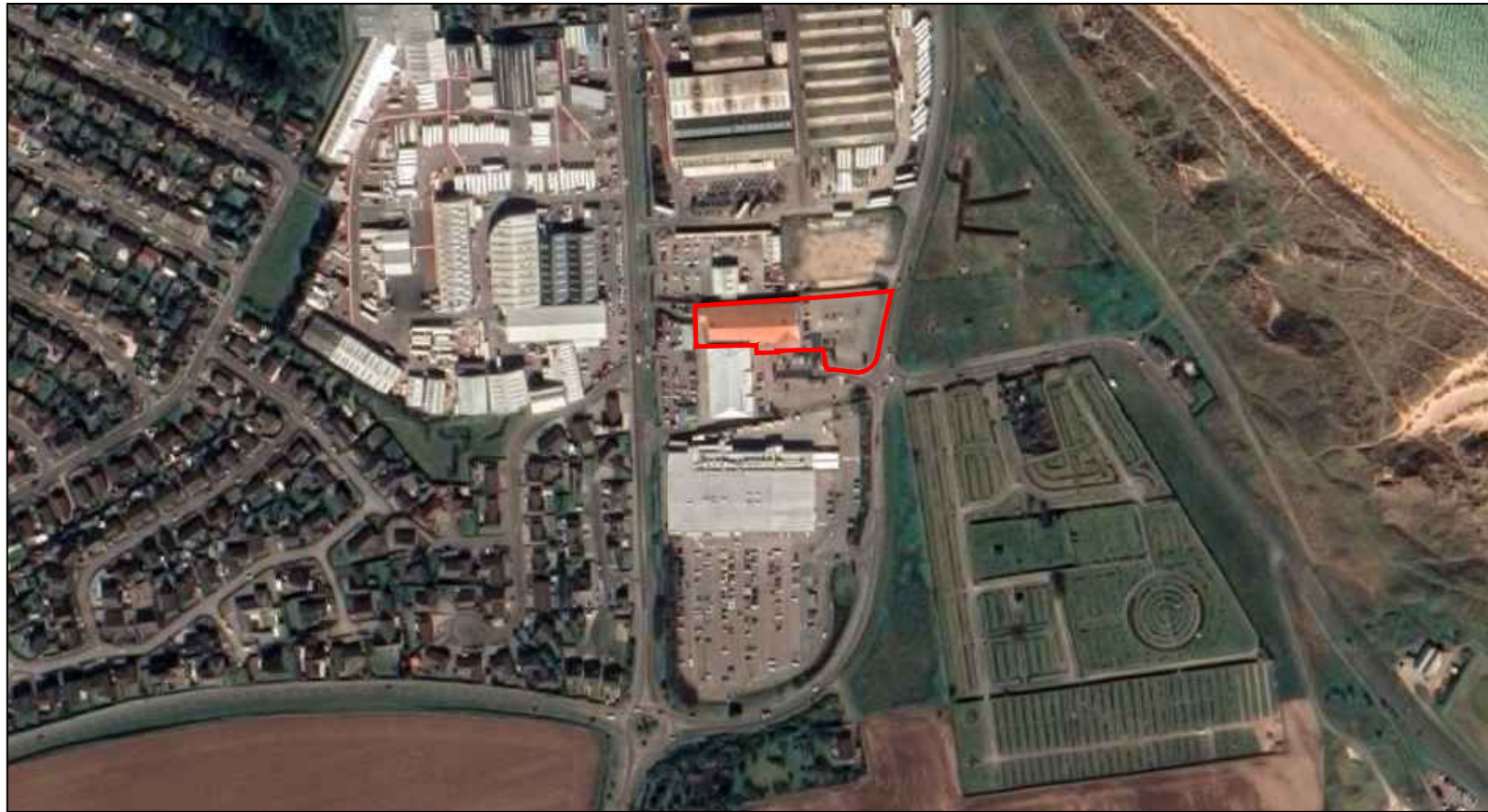
REFERENCE IMAGE | Imagery ©2021 CNES/Airbus, Getmapping plc, Map data ©2021 Google