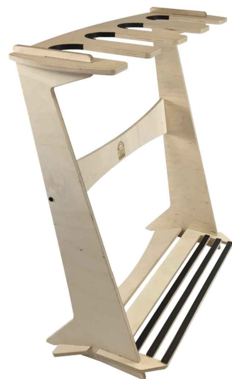
TYPICAL SURFBOARD RACK