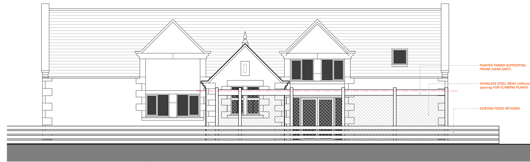
PROPOSED WEST SHOWING CANOPY AND TRELLIS 1:100 @ A1