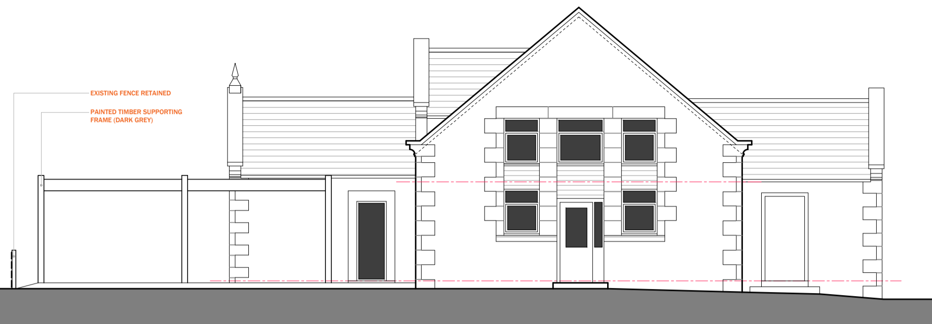
PROPOSED SOUTH ELEVATION SHOWING CANOPY 1:100 @ A1