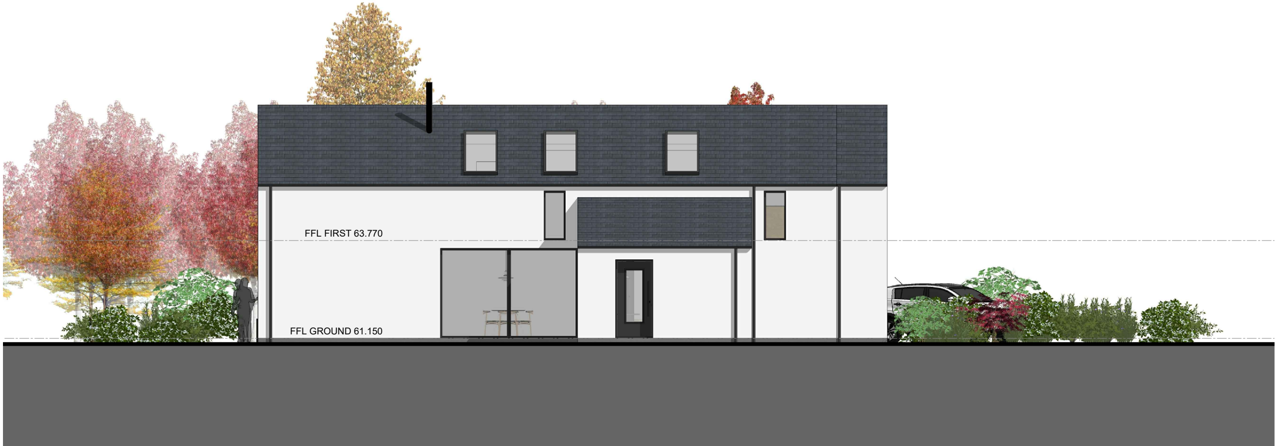
WEST ELEVATION AS PROPOSED