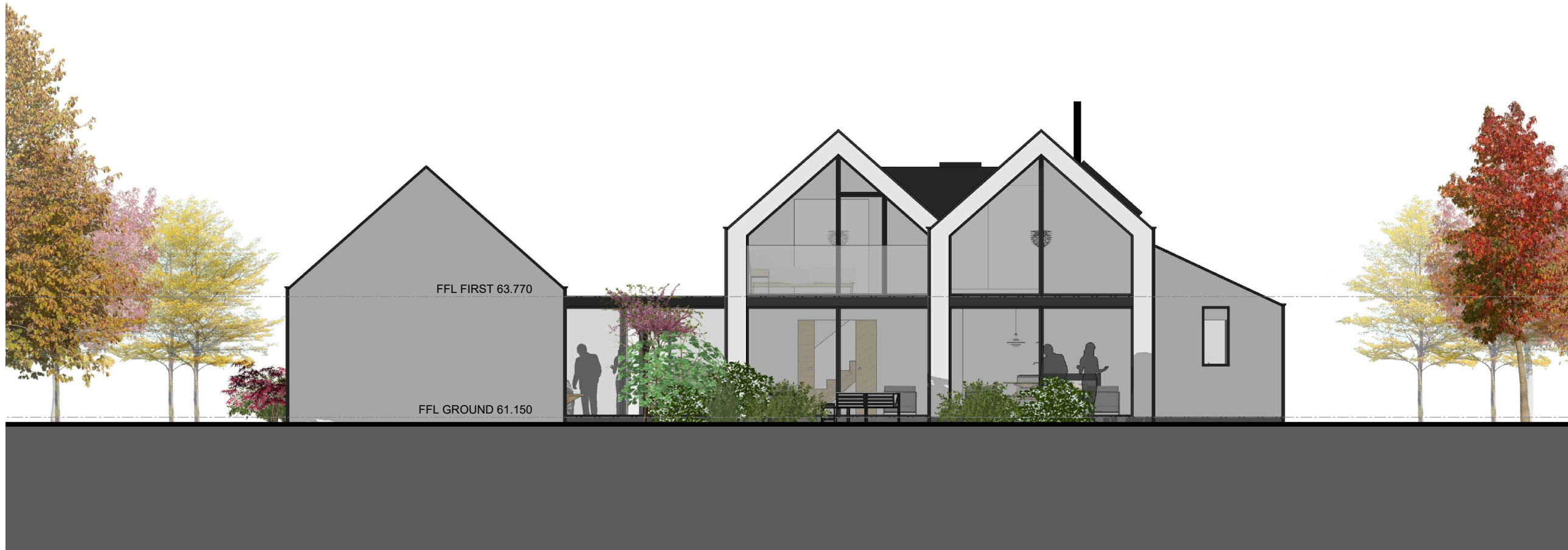
NORTH ELEVATION AS PROPOSED