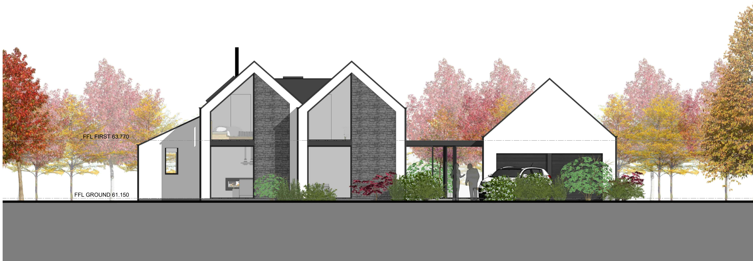
SOUTH ELEVATION AS PROPOSED