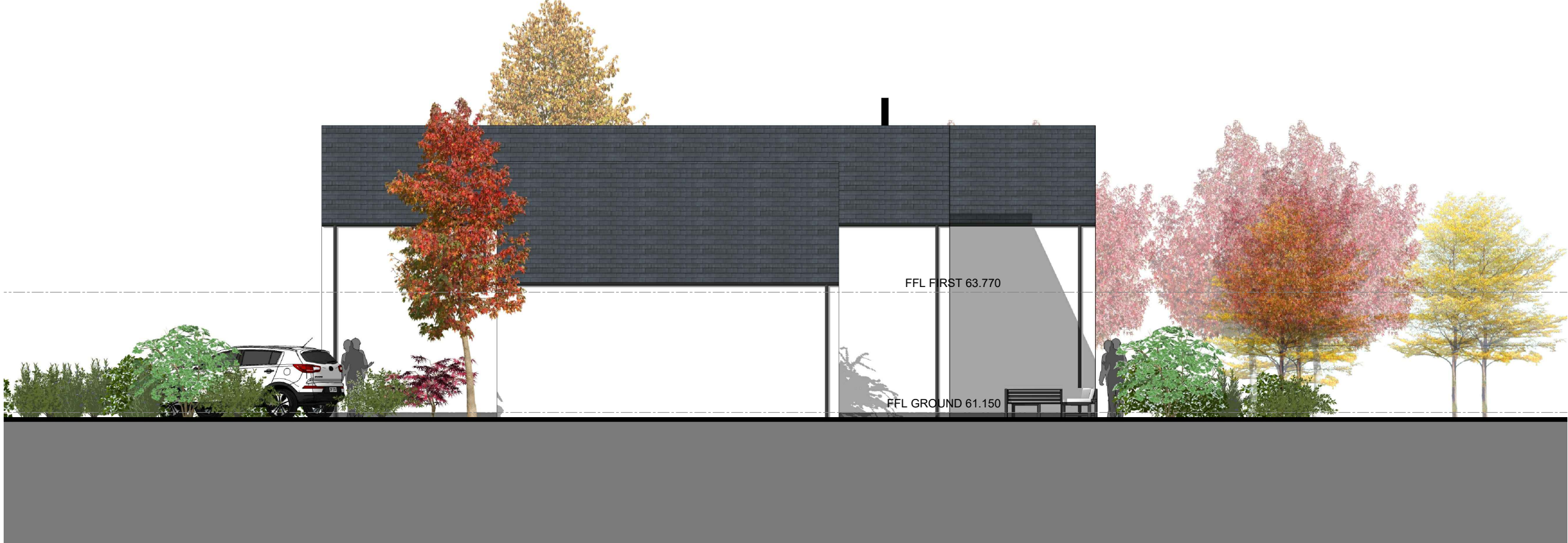
EAST ELEVATION AS PROPOSED