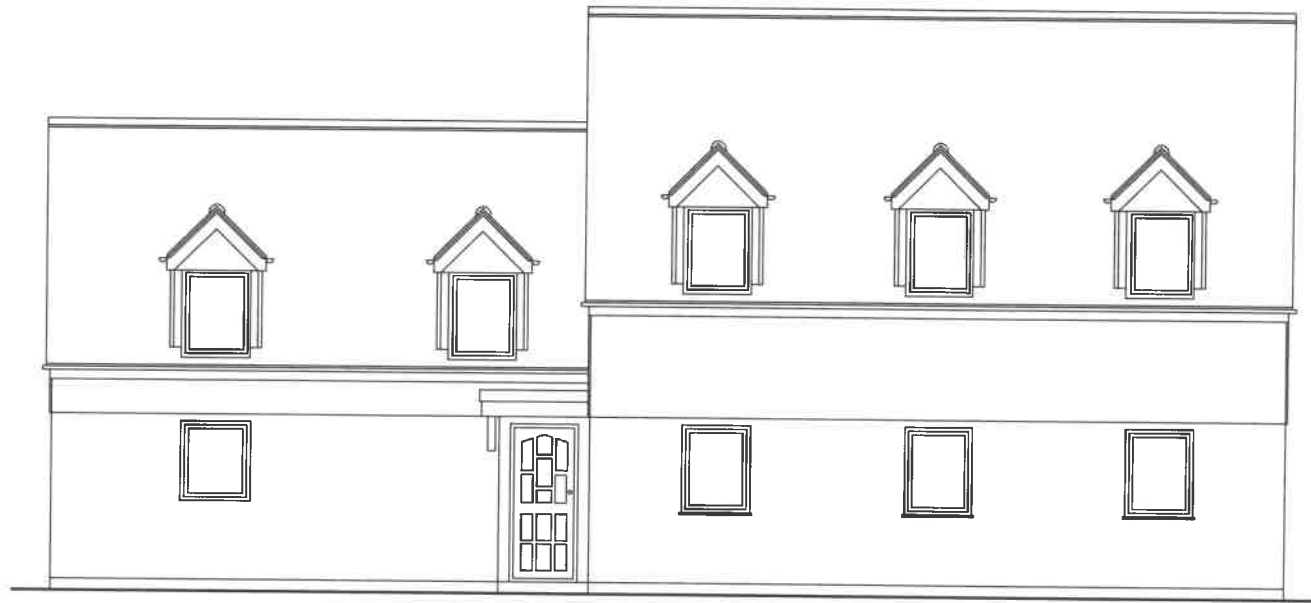
FRONT ELEVATIONS 1:100