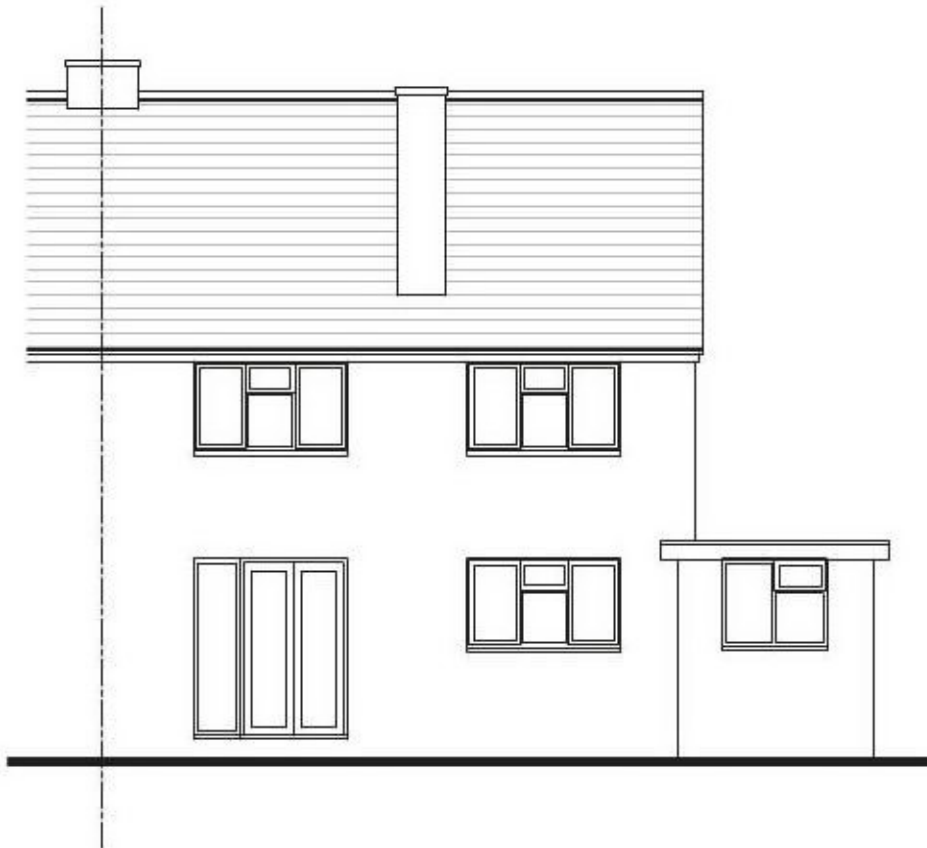
Existing Rear Elevation View C