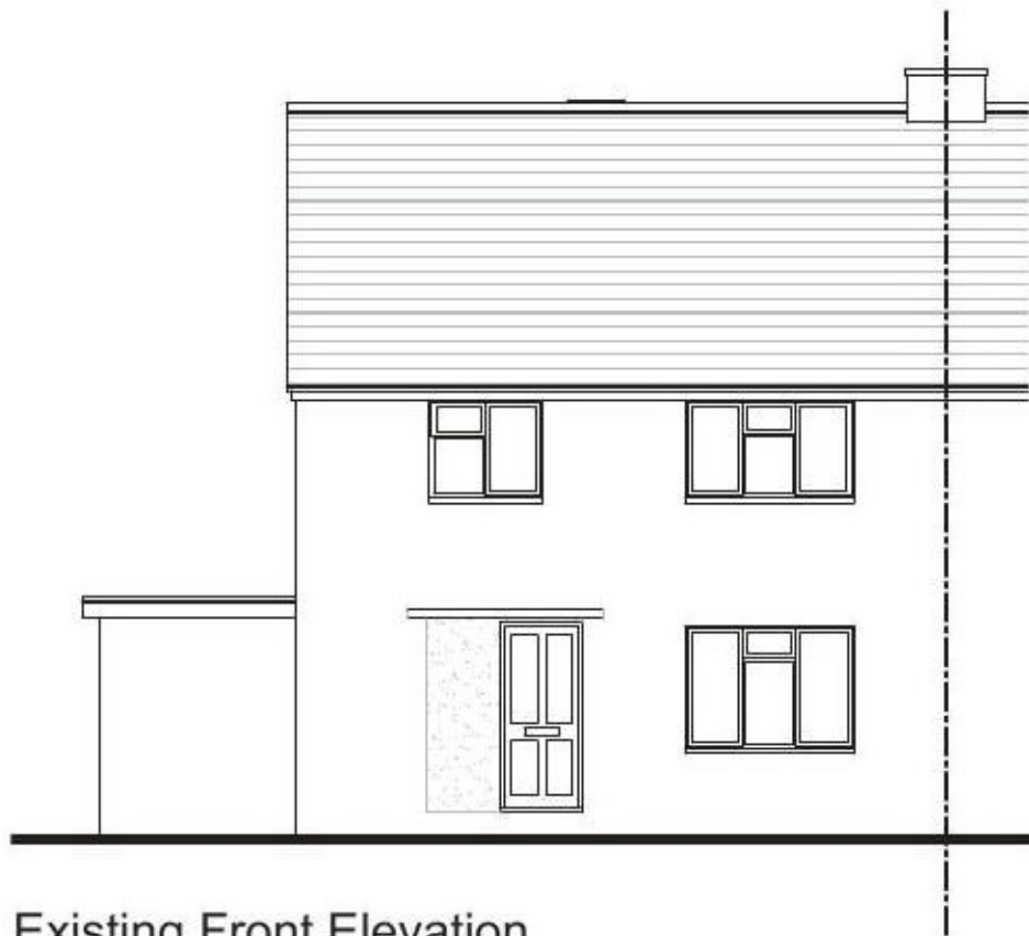
Existing Front Elevation View A - Scale 1:100