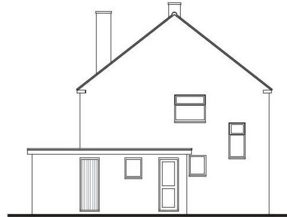
Existing Side Elevation View B