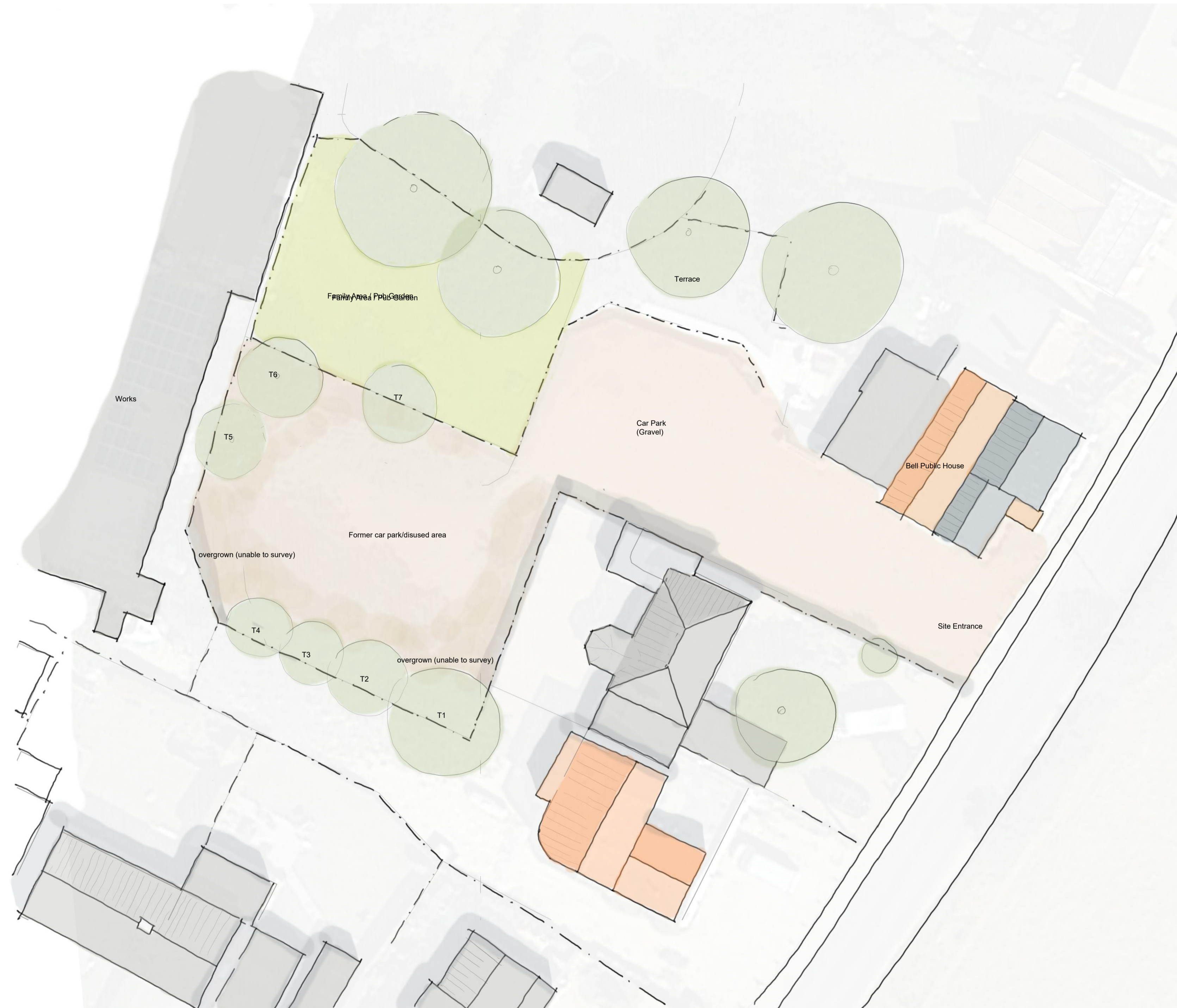
EXISTING SITE PLAN 1:200

DO NOT SCALE. The Contractor must verify all dimensions prior to commencing shop drawings or works on site. Exact setting out and final levels to be agreed on site.