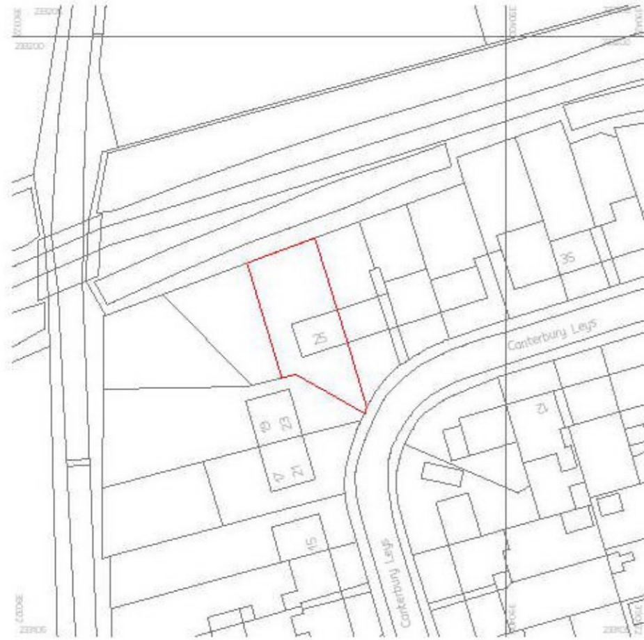
LOCATION PLAN SCALE 1:1250 (@A3)