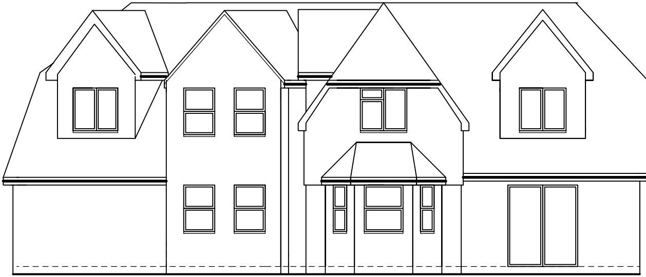
front (west) elevation