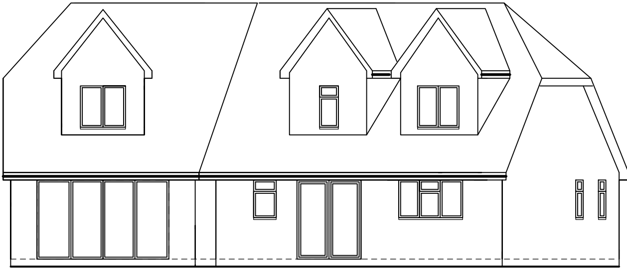
rear (east) elevations