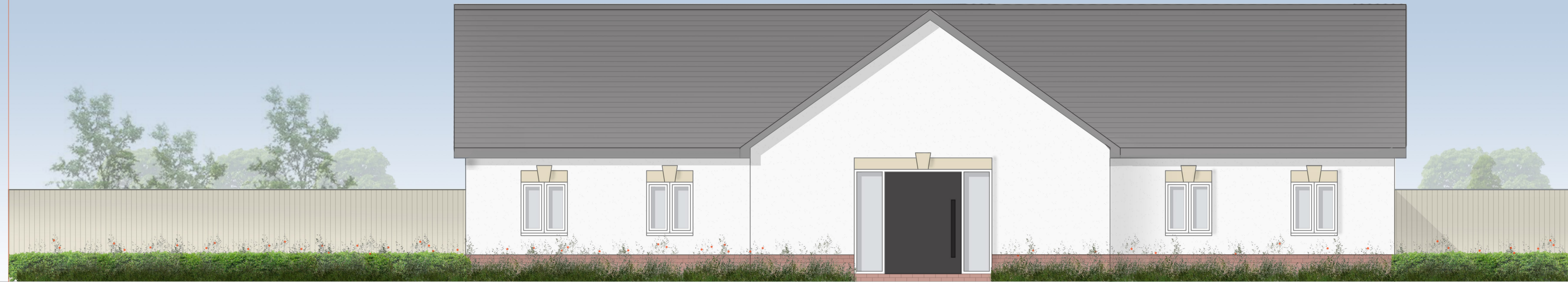
1 ELEVATION A-A (FRONT ELEVATION - SOUTH)