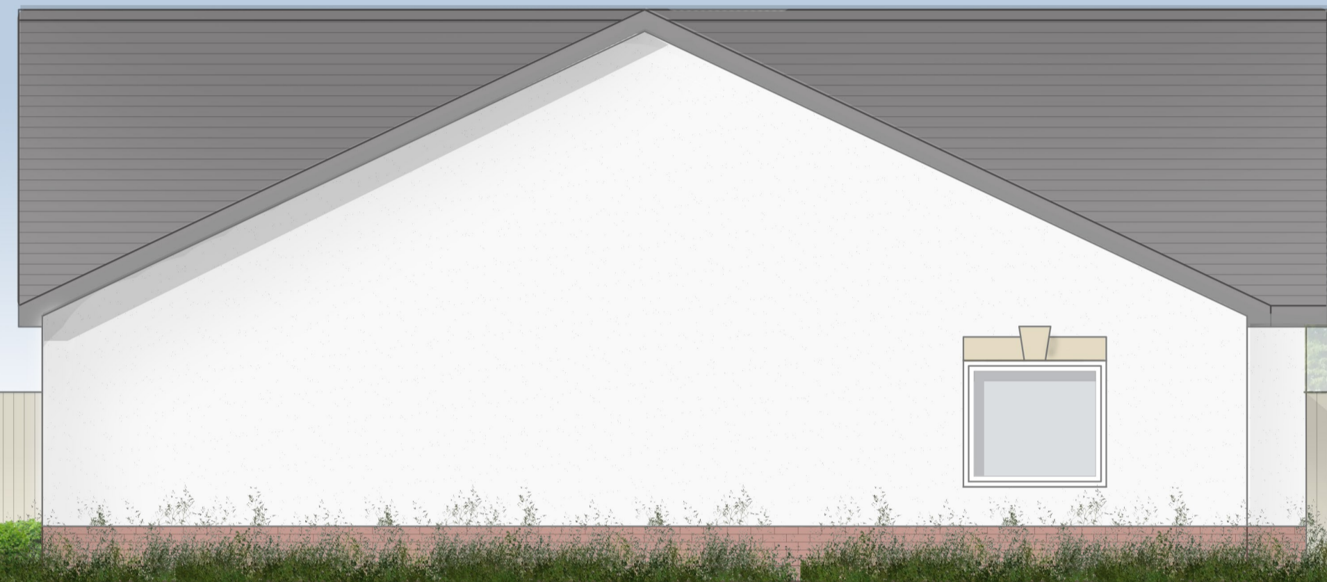
2 ELEVATION B-B (SIDE ELEVATION 1 - WEST)