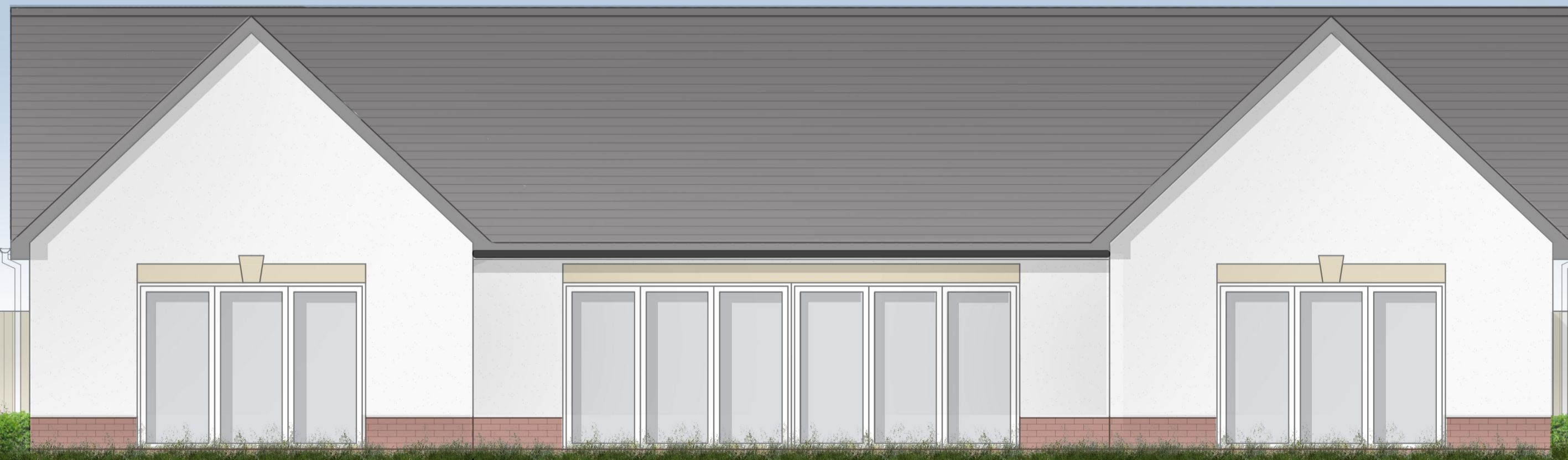
3 ELEVATION C-C (REAR ELEVATION - NORTH)