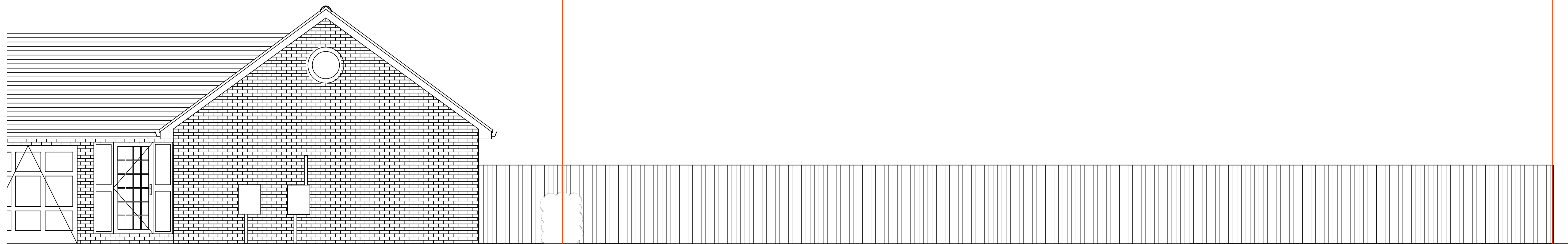
3 EXISTING ELEVATION BB SCALE: 1:50 @ A1