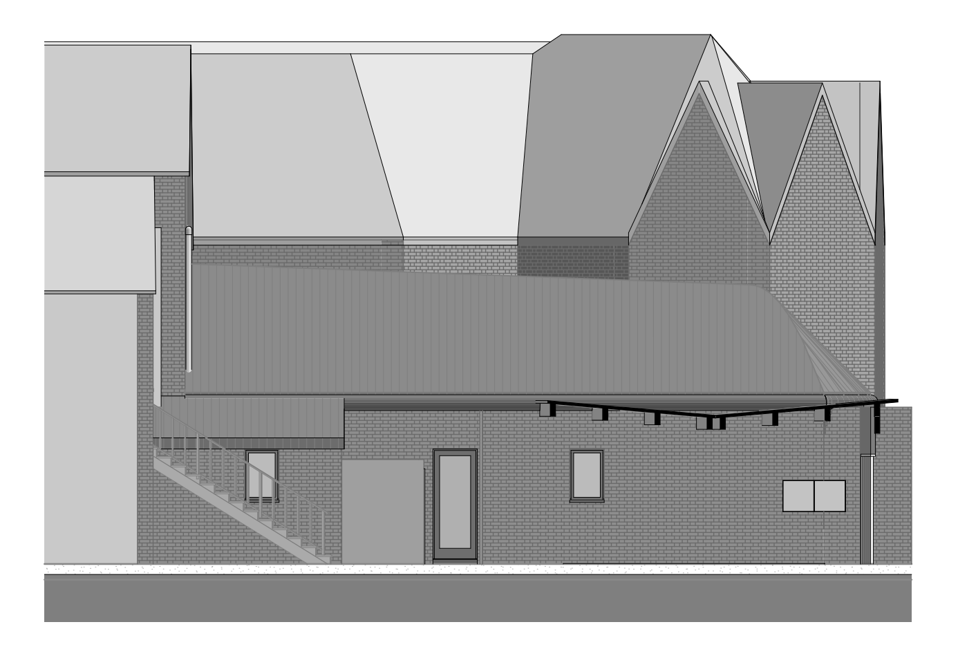
Proposed North Elevation