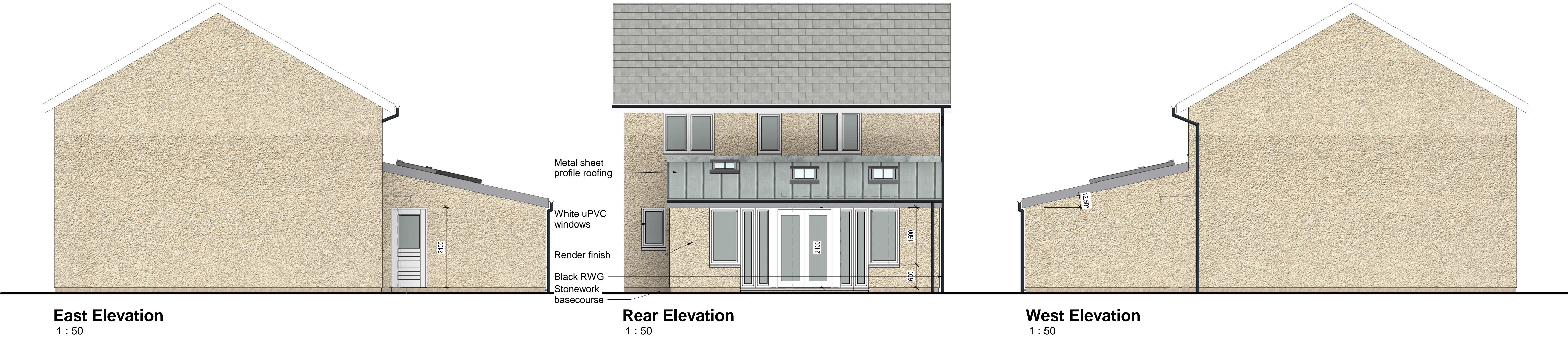
East Elevation 1 : 50