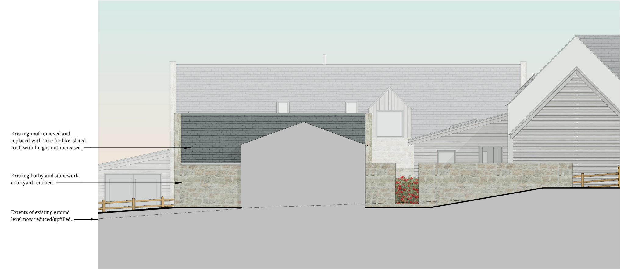
North west internal elevation