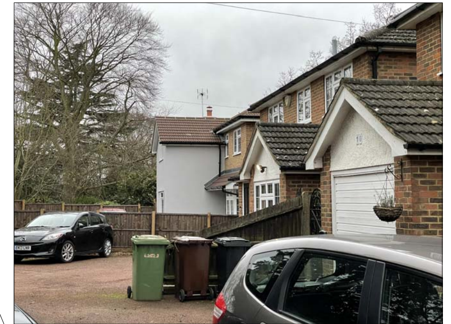
VIEW TOWARDS 12 AND 12A LONGDOWN LANE NORTH existing front projection at No.12a to be matched and establishes building line