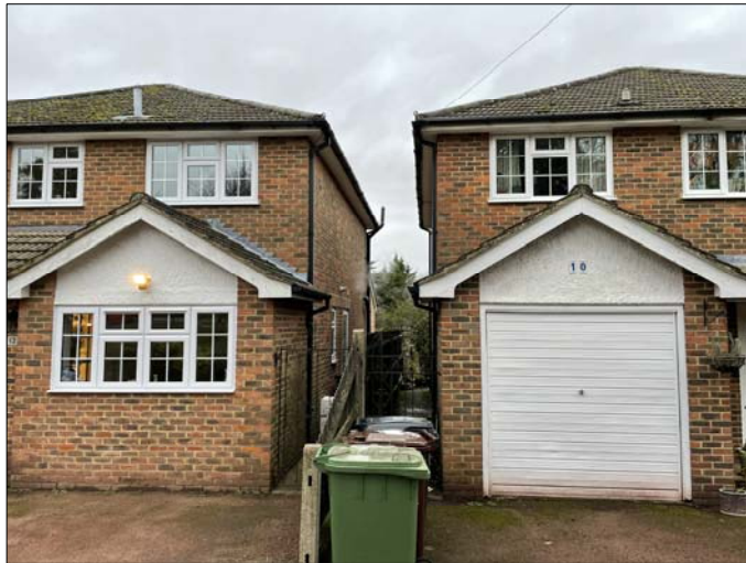
VIEW TO BOUNDARY WITH No 12 proposed extension to garage will not impact outlook or light