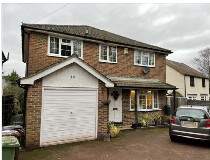
EXISTING FRONT FACADE No 10