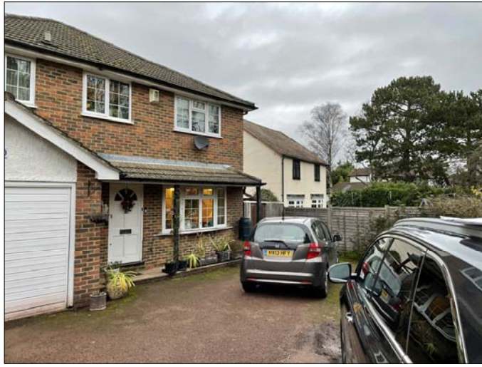
VIEW TOWARDS 66 EWELL DOWNS ROAD proposed extension to garage will not impact outlook or light