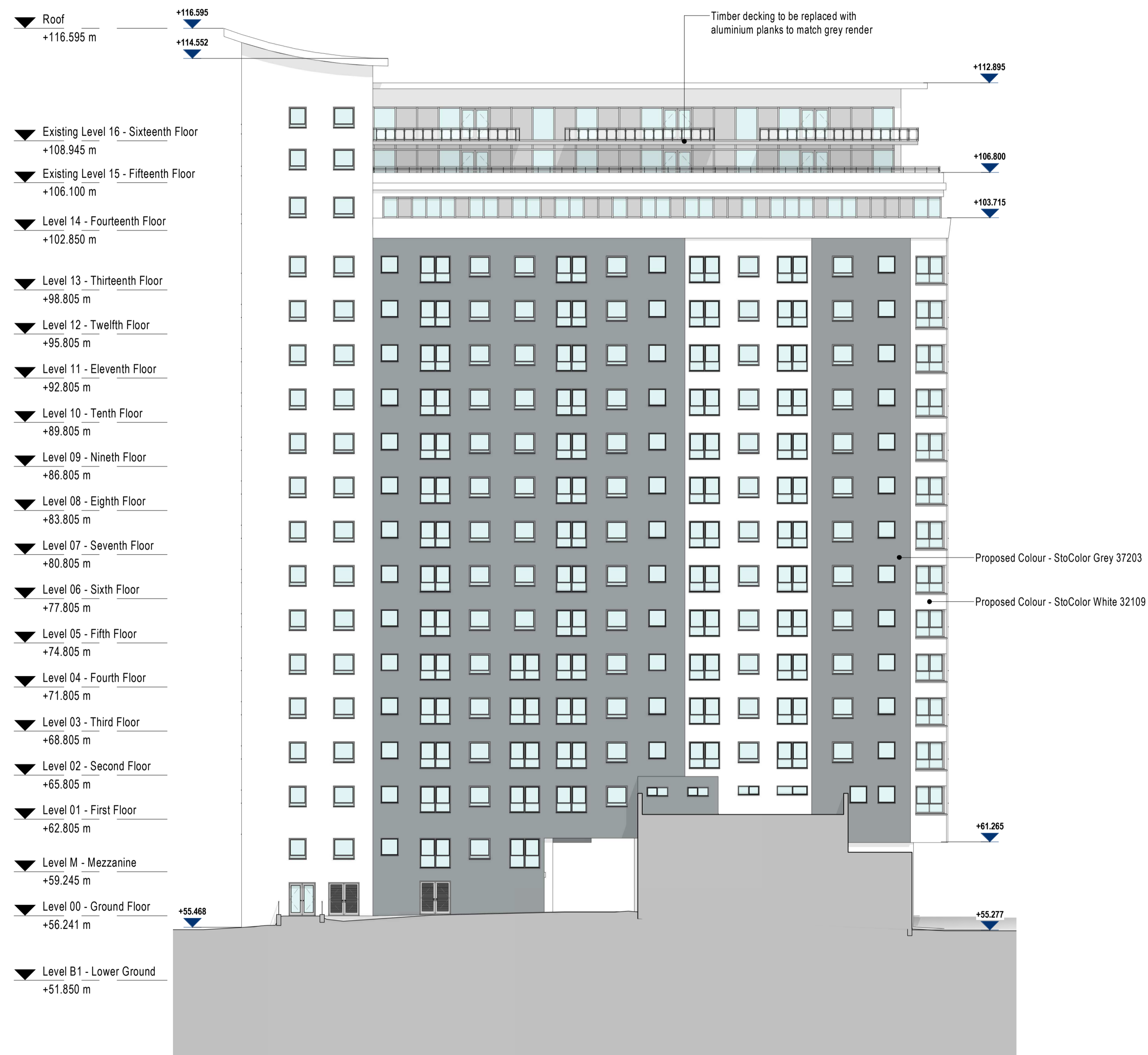
Proposed West Elevation 1 : 200

DO NOT SCALE ANY DIMENSIONS OFF THIS DRAWING. ANY DISCREPANCIES BETWEEN THIS DRAWING AND OTHER INFORMATION ARE TO BE REFERRED TO MCM ARCHITECTURE LIMITED. WHERE THE DRAWING RELATES TO AN EXISTING BUILDING OR COMPLETED CONSTRUCTION THE CONTRACTOR IS RESPONSIBLE FOR CHECKING THAT THERE IS NO CONFLICT BETWEEN ACTUAL BUILDING DIMENSIONS AND DRAWING DIMENSIONS. IN THE EVENT OF DISCREPANCIES BETWEEN THIS DRAWING AND SUBCONTRACTORS APPROVED WORKING DRAWINGS FOR RELEVANT BUILDING COMPONENTS, THE SUBCONTRACTORS DRAWING SHALL TAKE PRECEDENCE. ANY CONFLICTS ARISING OUT OF INFORMATION AS NOTED ABOVE MUST BE REPORTED IMMEDIATELY TO MCM ARCHITECTURE LIMITED. THIS DRAWING IS THE COPYRIGHT OF MCM ARCHITECTURE LIMITED. ALL DIMENSIONS ARE IN MILLIMETRES UNLESS OTHERWISE STATED.