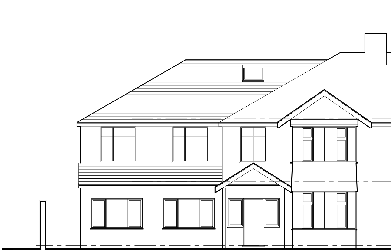
1 front elevation as existing scale 1:100