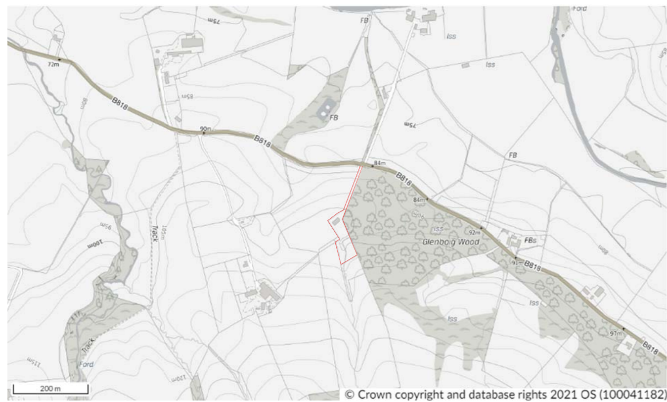
Location Plan 1:10000