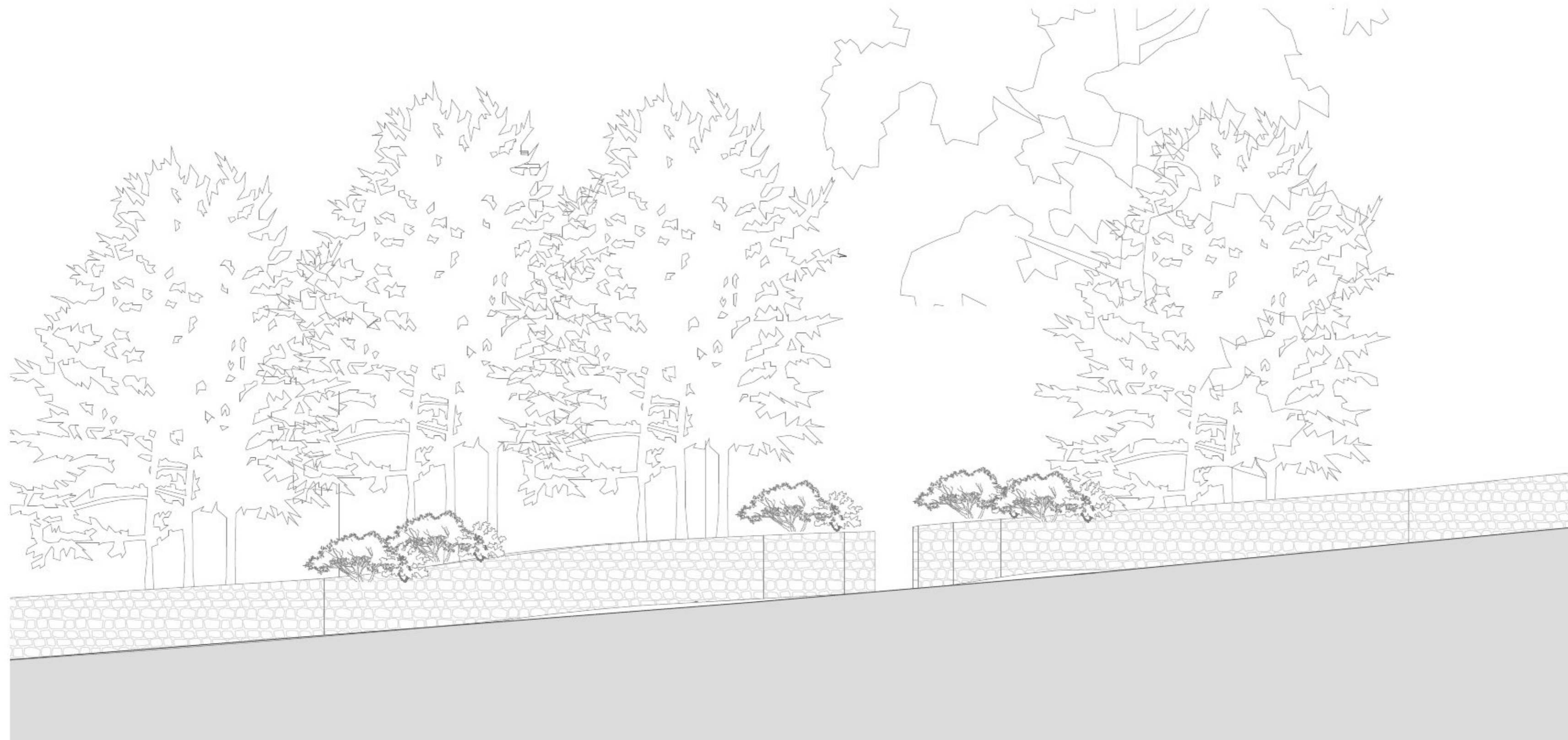
Existing East Elevation 1:100