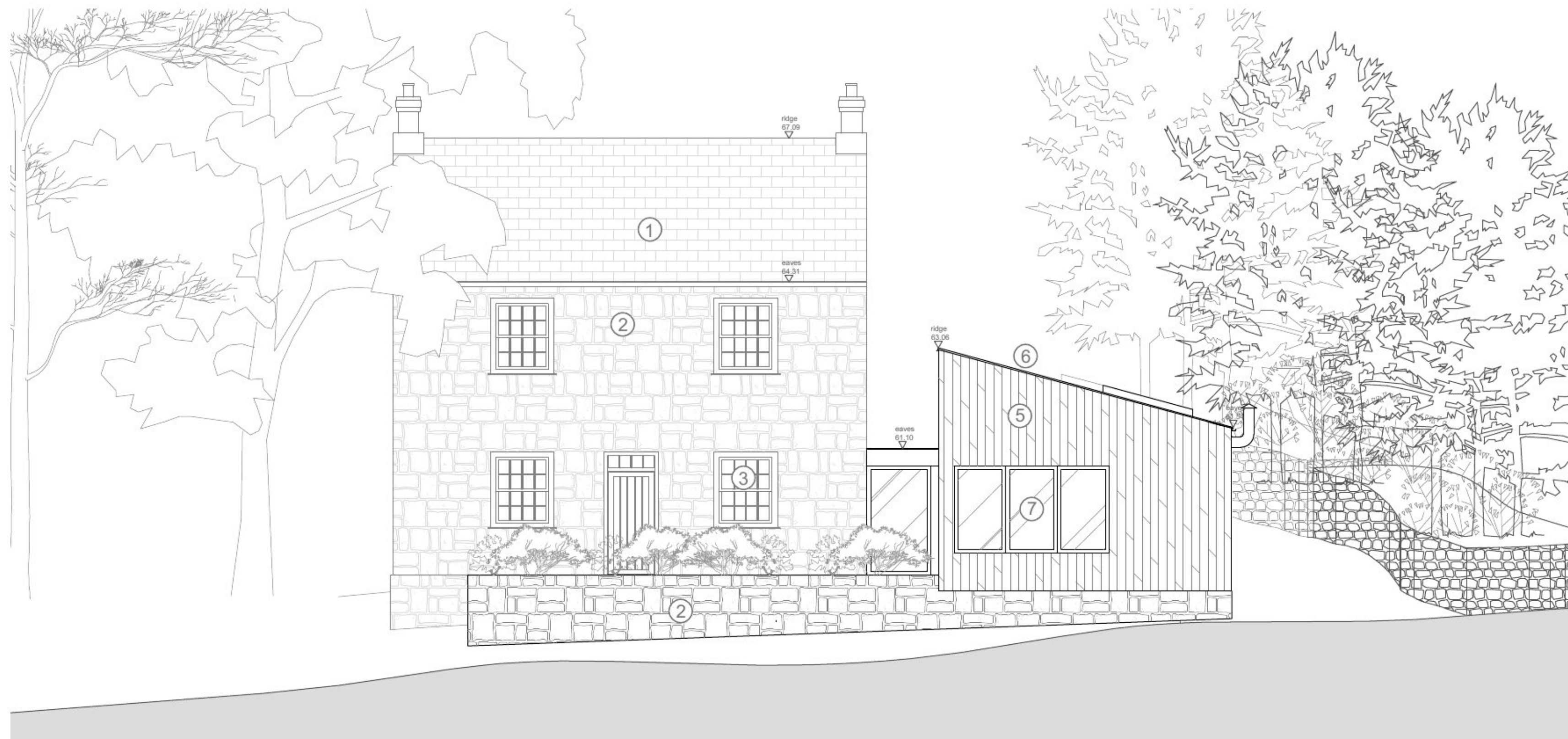
Existing South Elevation 1:100