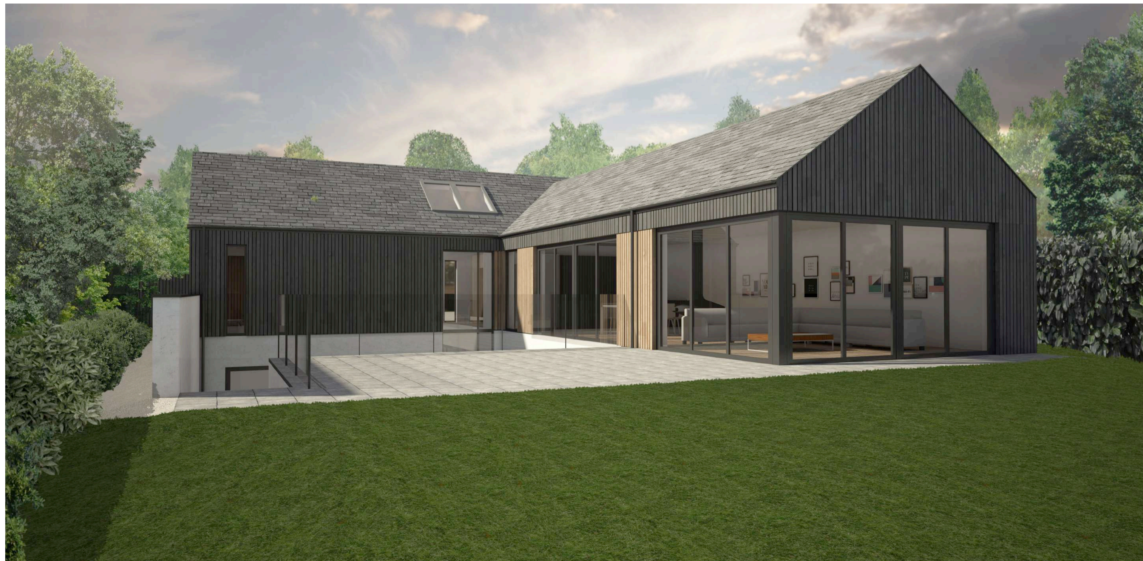
Visualisation of Proposed Back of House