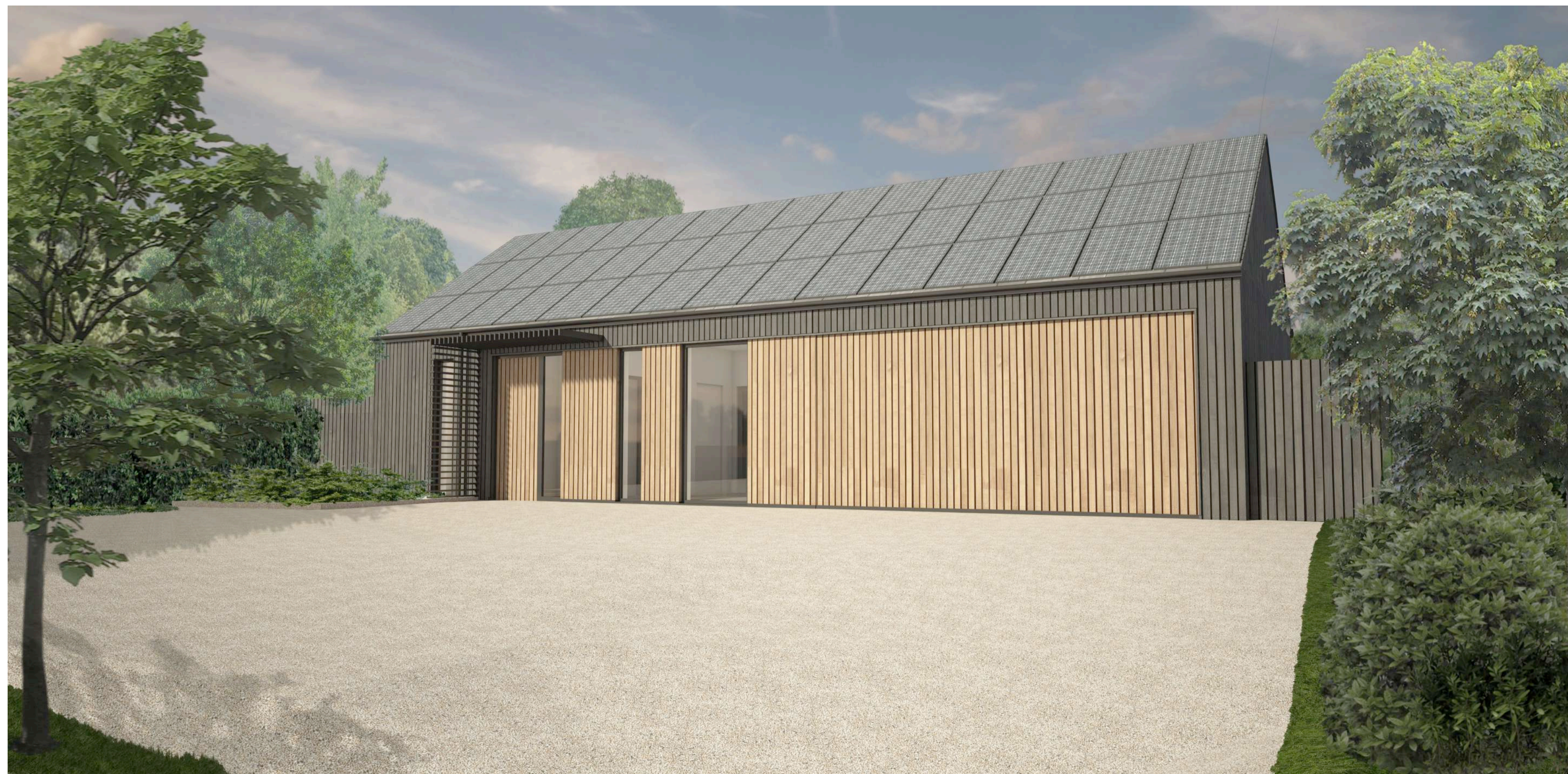
Visualisation of Proposed Front of House